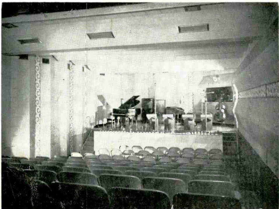
Studio A, Radio Center —originating point for the northwest's favorite audience programs including "What's the Weather" and the "Northwest Farm Front."