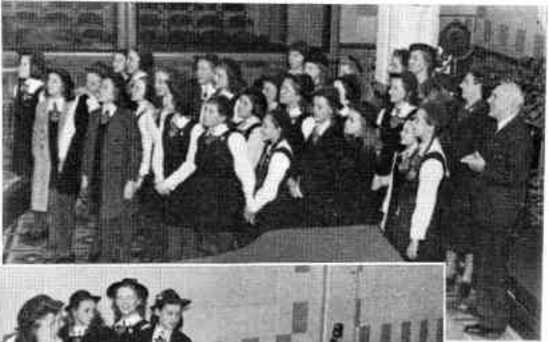
Watching the Clock