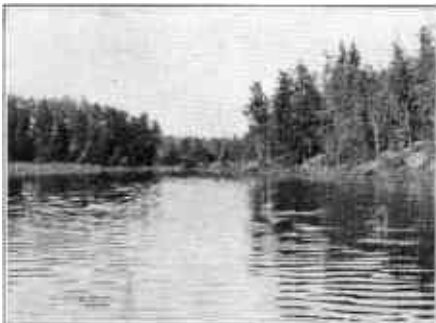
A quiet reach at the head of Crow Duck Lake

At this stage of the journey the canoeist, especially if he is a newcomer to this land of Canada, will be amazed at the abundance of so many forms of