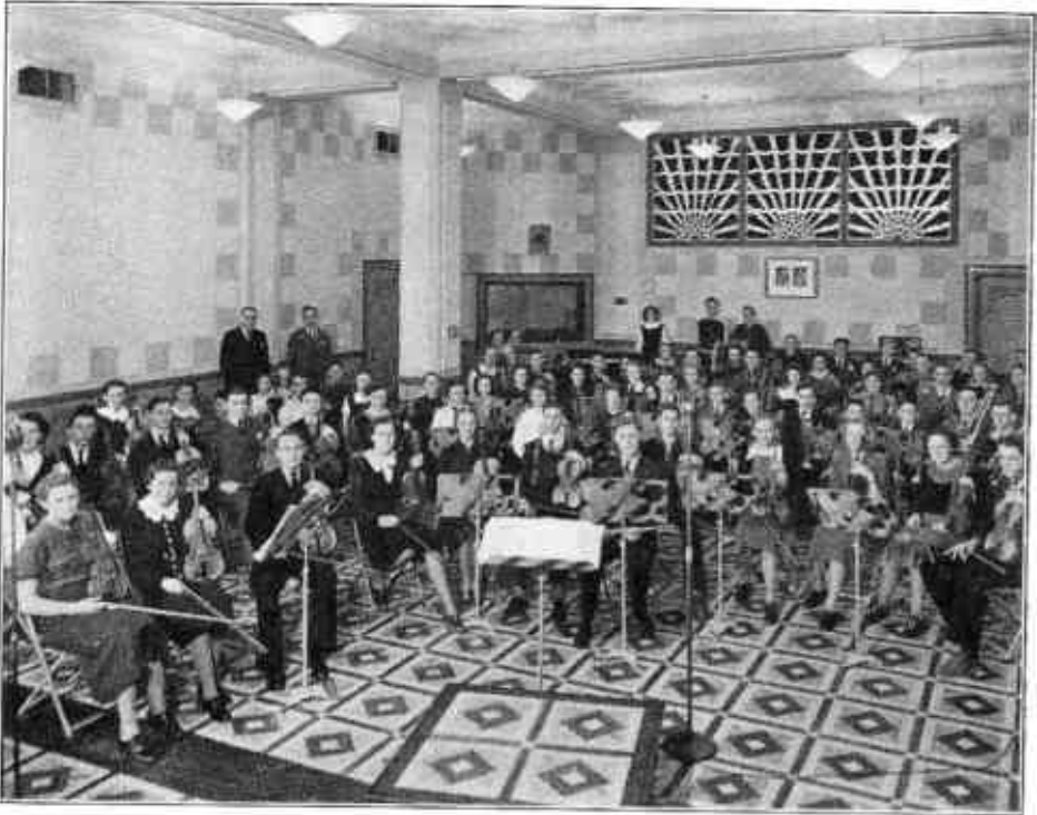
High Schools Orchestra in Studio I.

joining it, and entered by a separate door opening from the vestibule, is a control room equipped with mixing panel, etc. Here, the program director and the control operator can observe the performers and listen to the program by means of a loud speaker and headphones. We pay a brief visit to this room, and then our guide takes us along the vestibule and pauses at a door. "Now," he says, "we shall see our finest studio."