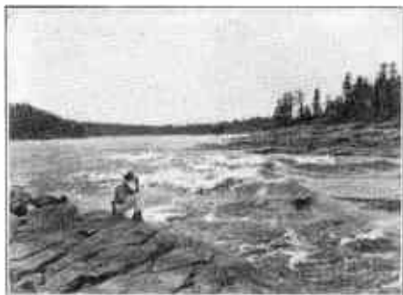
The Boundary rapids, where the Winnipeg river crosses the Ontario border and enters the chain of lakes.

was difficult, the water being dangerous under the influence of a strong wind, but the map guided us to Boundary Falls, at which point on the Ontario border the Winnipeg river enters the chain of lakes. Thenceforward this mighty water-course became our pathway for over fifty miles, although the river seemed to be nothing more than another series of tranquil lakes, connected by narrow gorges of faster moving water. All along the river we passed unexploited forest land, blocks of it however still revealing the partly healed scars of recent destructive forest fires. Secure in the fastness of these woods we made ideal camps on sites unchanged since they were used by La Verendrye and all those who passed by as they wove the web of western pioneer history, or we rested on portage trails which had been little disturbed since those days when the cliffs and forests echoed the rollicking songs of the coureur du bois .