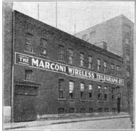
William Street, Montreal, where Canadian broadcasting commenced in 1919. The transmitter and "studio" were on the top floor. To the right is the chocolate factory.