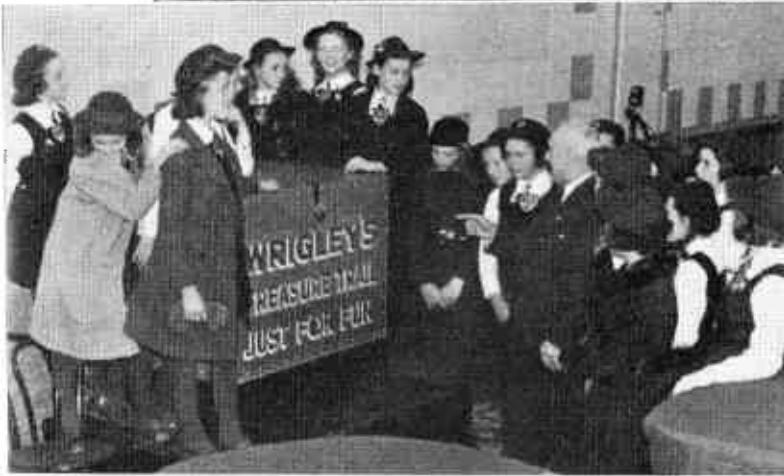
The Treasure Trail Mail Box