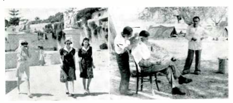
Left: Maltese girls dress, act and look like girls the world over. Smartly dressed and well educated, they are accomplished linguists, adding English, French and Italian to their native Maltese. Right: Corsicans, by virtue of their geographical limitations, are alert to added means of livelihood. With the coming of Allied troops these two opportunists have set-up a roadside barber shop.

Under such adverse conditions sponsored by war, understanding and cooperation were achieved. Now, and in the future, time will enable us to carry on these understandings—for a lasting peace can never be made without the complete and unselfish desire to know and understand the other's point of view. Basically, human beings are much the same, only environment and circumstances emphasize the differences.