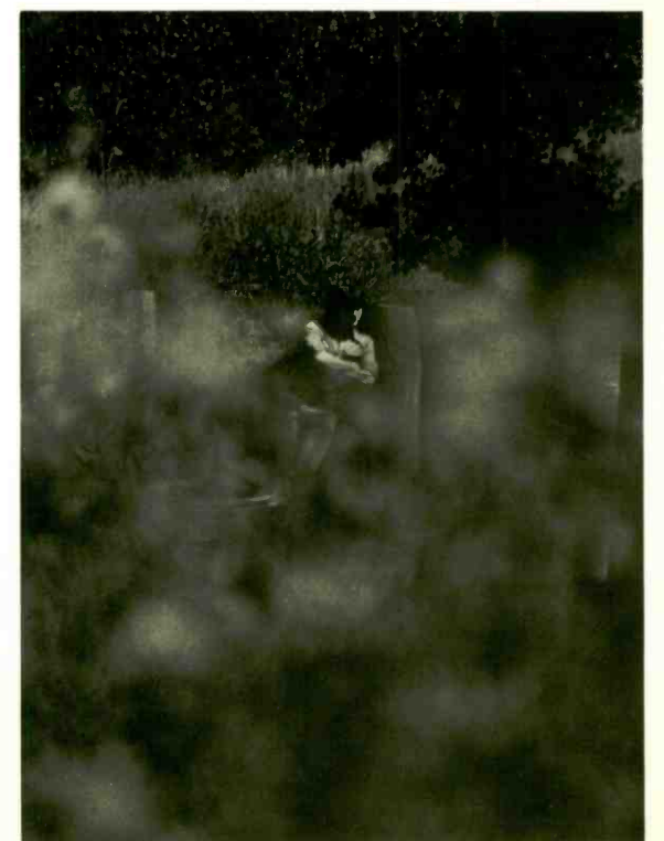
Comes from North Syracuse, NY