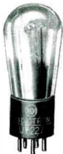
UY 227 Detector— Amplifier