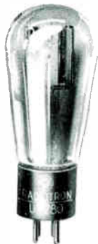
UX 280 Full Wave Rectifier