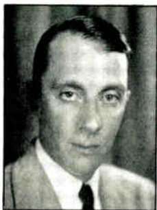
Graham McNamee National Broadcasting Company WEAF-WJZ New York City

A ND, we might add, of The World! For wherever radio has gone Mac's voice has gone with it and his watch chain is heavy with the keys of the country's important cities, bestowed on him by admiring mayors. When Mac goes to a town to make a personal appearance the entire population turns out to welcome him and yet there is no more modest celebrity in the country than this NBC star who looks on every broadcast as just another chance to make his best, better!