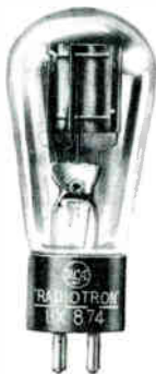
UX 874 Voltage Regulator