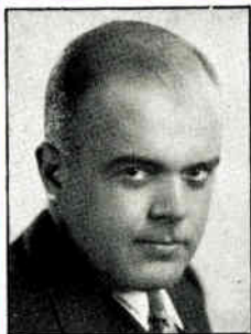
Phillips Carlin National Broadcasting Company WEAF-WJZ New York City

H E used to be a twin, a radio twin that is, and his side kick was Graham McNamee. When the two shared a broadcast from a football stadium, only the most astute listener could tell them apart, so alike are their voices. But now Phil is assistant to the Vice President.