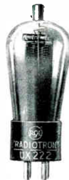
UX 222 Radio Frequency Amplifier