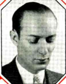
Ted Husing Columbia Broadcasting System WABC New York City

C OLUMBIA'S Big Boy and a close rival of Graham McNamee in the field of sports reporting, Ted is one of the youngest of radio's stars. He gallops through his arduous schedule with the enthusiasm of a youngster and to say "office desk" or "swivel chair" in connection with Mr. Husing would be like coupling an airplane and a tractor. Ted hits the high spots and what's more he brings the high spots home to the nation-wide hook-up of the CBS.