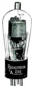
RCA 232 Radio Frequency Amplifier