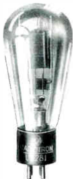
UX 281 Half Wave Rectifier