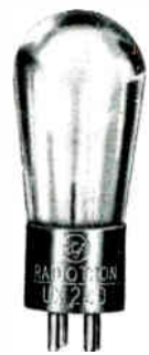
UX 240 (High-Mu) De- tector Amplifier