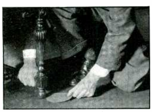
Felt pads under a set will often aid in minimizing unpleasant noises