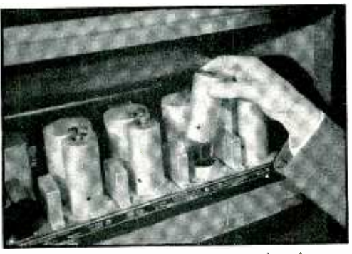
It is a simple matter to renew your tubes. A set of new RCA Radiotrons will improve your present reception