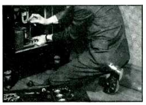
If something goes wrong with your set, call in a trained service man