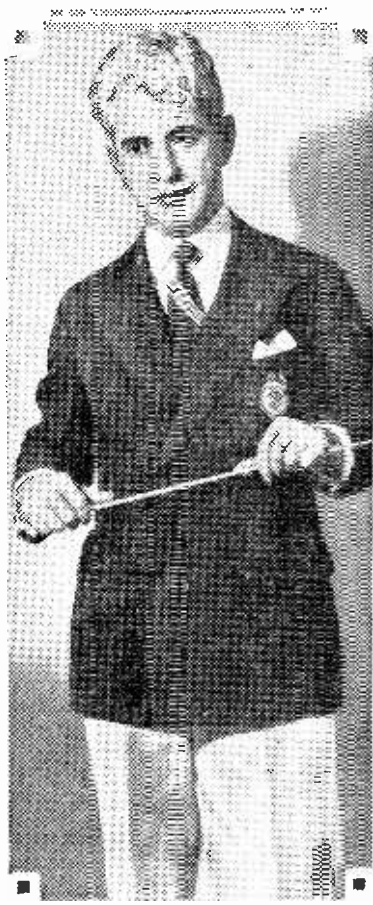
EDWIN FRANKO GOLDMAN

Edwin Franko Goldman, who has made musical history in his band concerts from the Mall in Central Park and from the campus of New York University, greeted a nationwide audience in his fifteenth summer concert series on Tuesday, June 14 in a program broadcast at 9:30 P. M. over a coast-to-coast NBC-WBZ network.