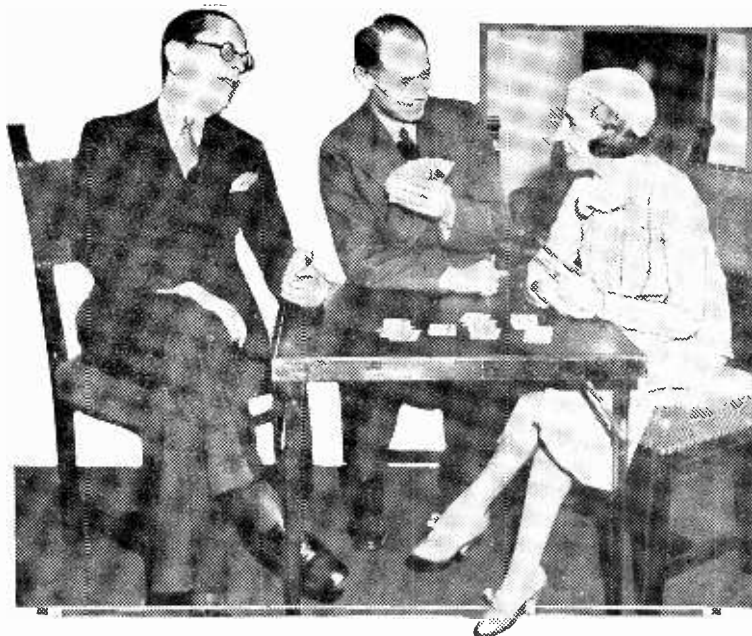
MR. ACE, ELY CULBERTSON AND MRS. ACE

A peek is better than a finesse, especially if you're looking at a hand held by Ely Culbertson, bridge expert on whom Mr. and Mrs. Ace, principals of Columbia's "Easy Aces" program, worked this subterfuge. Jane seems to be diverting Mr. Culbertson with one of her disarming smiles while Mr. Ace is not above peering over the master's shoulder. Culbertson, incidentally, confesses himself to be an "Easy Aces" enthusiast. The program is heard each Monday, Wednesday and Friday at 7:30 P. M.