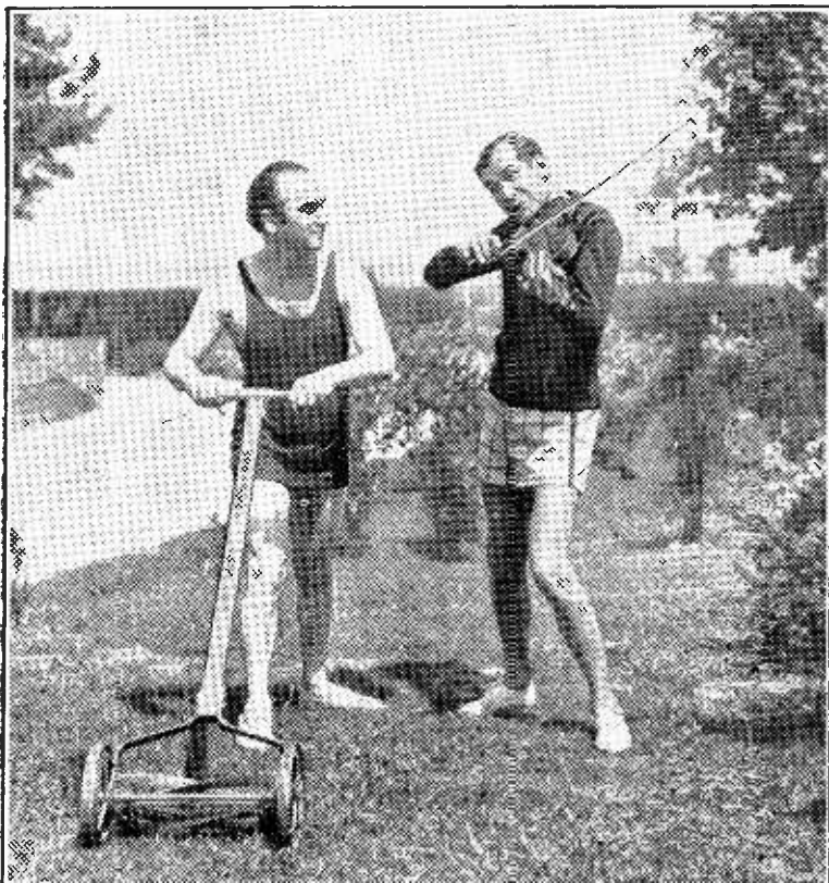
DAVE RUBINOFF AND HARRY RICHMAN

It's not a new musical instrument, just a lawn mower, but Harry Richman doesn't like to push it around his Beechurst estate on Long Island. So when trimming time comes, Richman persuades Rubinoff to cut the grass in exchange for some "real" fiddling. The two Chase & Sanborn entertainers are heard over NBC-WTIC networks each Sunday Night at 8:00 P. M. Rubinoff with his orchestral numbers and solos, Richman with song and comedy.