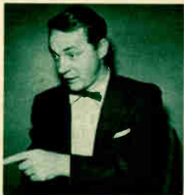
"Now if Paul took back what he said, the least you can do . . ."