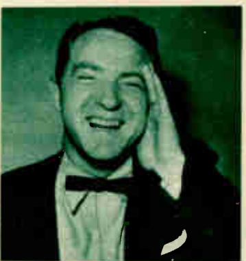
"How can they talk like that and still part friends? Wow!"