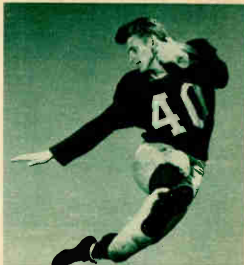
TOM FEARS , former Santa Clara star, started with the Rams in 1948. He holds league records in pass-receiving for one season (84), and one game (18).

Sooner or later, these youngsters are going to get their horns on that title. If you don't believe us, just ask any of their thousands of loyal L. A. fans. Better yet, ask the players themselves.