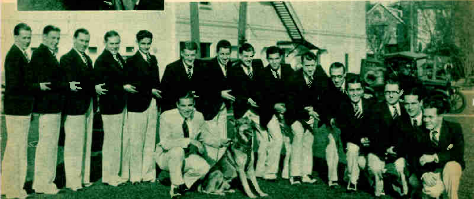
▼ "SHELL HAPPY TIME" in 1928 meant Horace Heidt's Orchestra. Do you recognize any of these bandsmen who have since become stars in their own right?