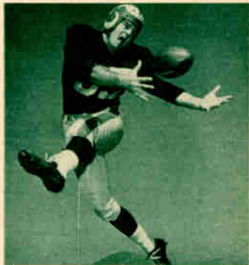
GLENN DAVIS , former Army great great, and All-American 1944-46. This is Glenn's second year with the Rams.