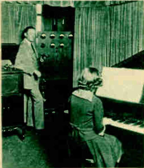
◀ KFI'S FIRST RADIO studio at 1000 South Hope Street back in 1922. The man in the background was a combination announcer, engineer and disc jockey.