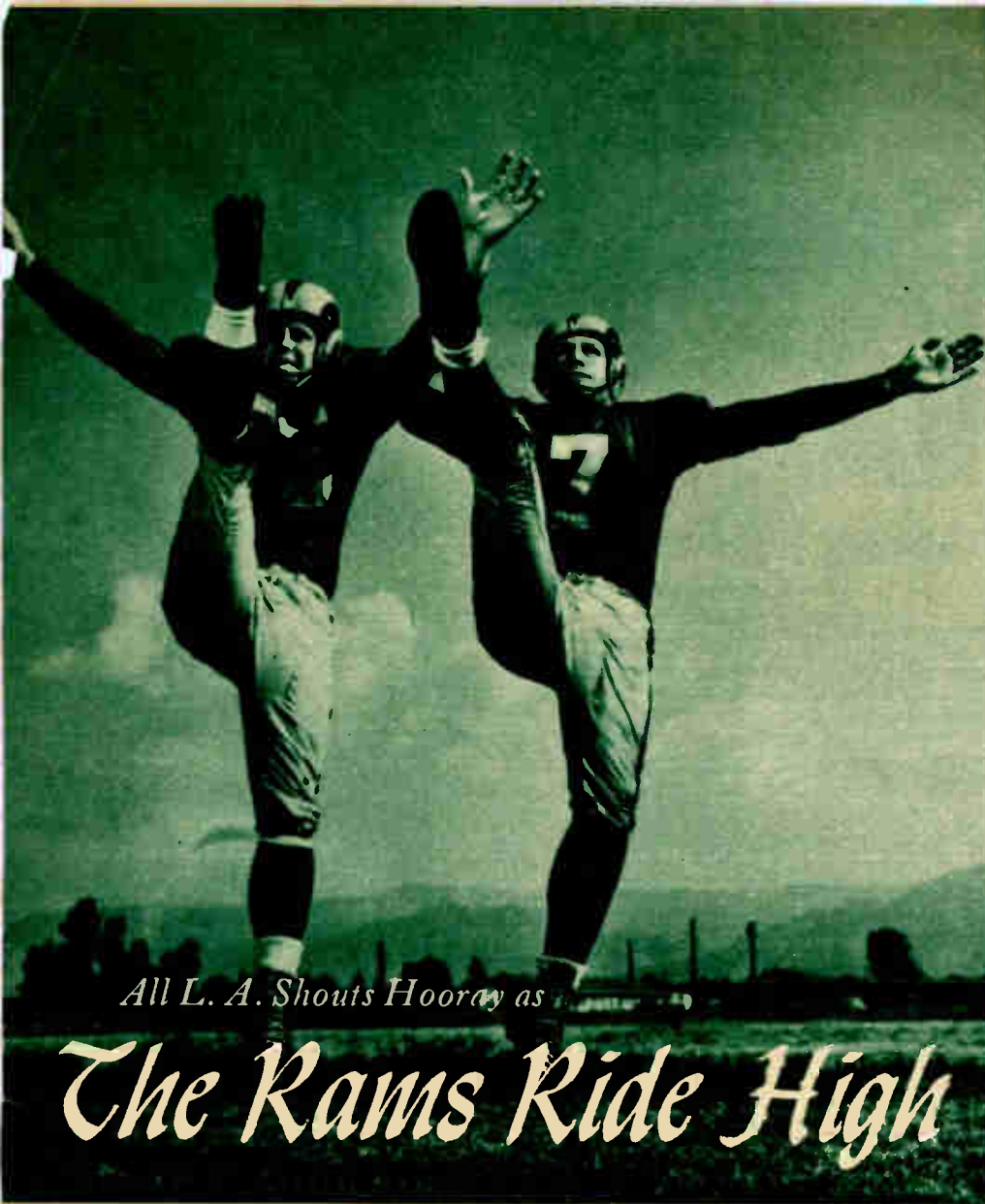
All L. A. Shouts Hooray as