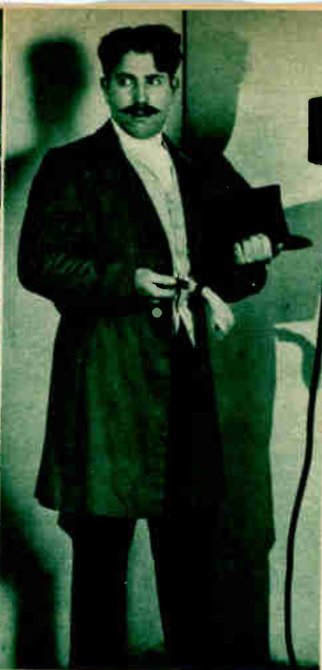
▲ CAN'T TELL WHETHER Hal Peary was Dapper Dan or Villain Van as he appeared in NBC's "Spotlight Review." Hal was some slimmer in those early days of radio, though lately he has streamlined his figure again.