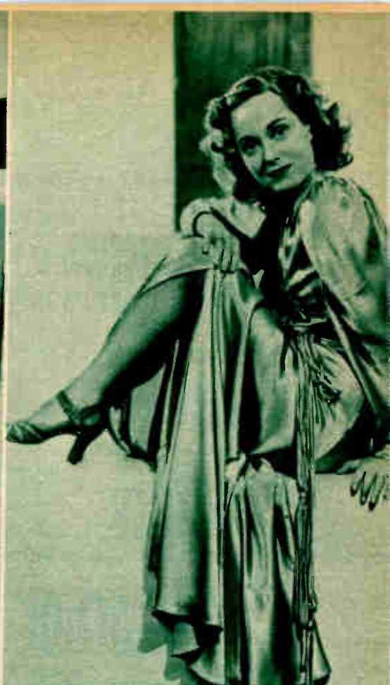
▲ FROM SOAP OPERA "Pepper Young's Family" to Broadway's hit play "Our Town" is Martha Scott's story. The anonymous member of NBC's serial became a very prominent member of Broadway overnight.