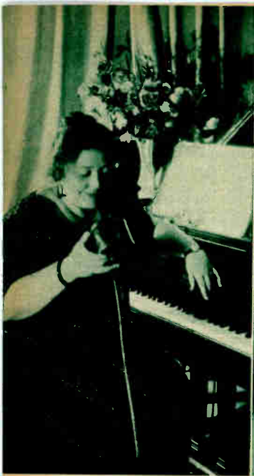
▲ THE LATE VAUGHN de LEATH was NBC's blues-singing star way back in 1927. Dinah Shore in modern times and modern dress is NBC's current vocalovely.