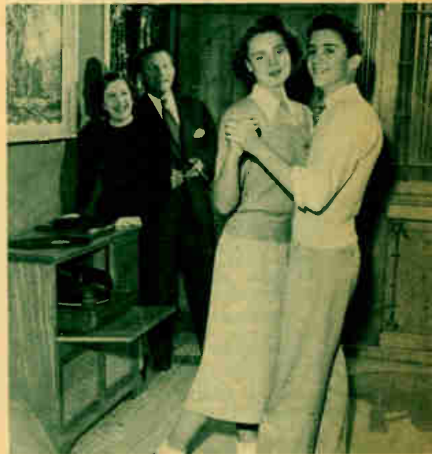
▲ THE BURNS CHILDREN make full use of the recreation room, and mother and father get full enjoyment from their offspring's impromptu dancing performances.