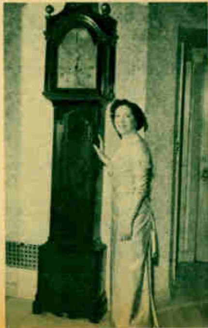
▲ TASTEFULLY DECORATED to Gracie's wishes, the Burns home is furnished with a number of beautiful heirloom pieces such as this handsome clock.