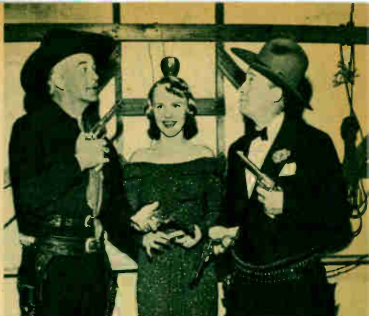
"HOPALONG CASSIDY" gave "Creepalong" Crosby some pointers on fancy gun-play during the Crosby broadcast that co-starred Bill Boyd. Peggy Lee acted the willing target.