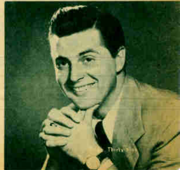
HANDSOME JOHNNY DESMOND handles singing chores on ABC's popular "Breakfast Club" broadcasts, and feminine hearts flutter.