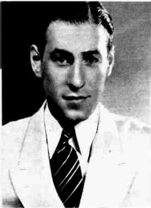
▲ BUDDY CLARK is a big-time singing star nowadays with his records and "Carnation Contented Hour." Back in 1935, however, when this was taken, he was singing just as well and going quite unappreciated — everybody was crazy about Lanny Ross.