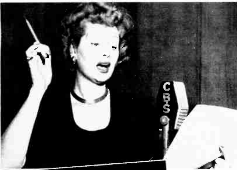
▲ MOST TYPICAL Ball gesture at the mike is this wand-like movement of the pencil, they tell us over at CBS.