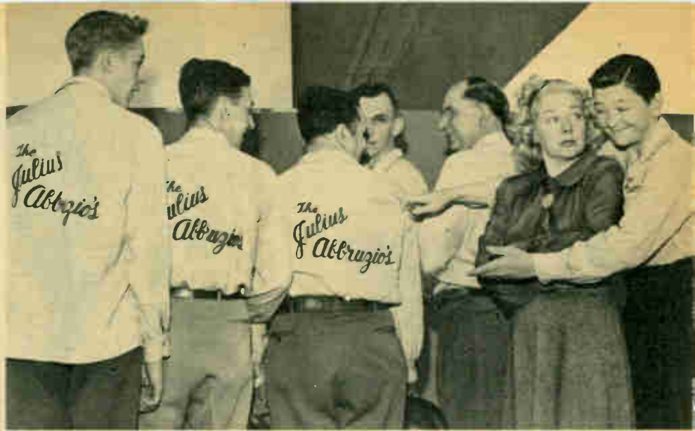
▲ WALTER TETLEY TAKES GREAT PRIDE IN INTRODUCING ALICE FAYE to his bowling team. As you can see, the team has taken the name of the amorous character Walter enacts on NBC's Phil Harris-Alice Faye series.