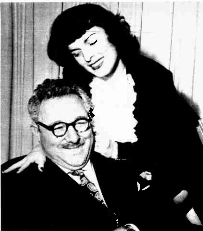
▲ MERCEDES McCAMBRIDGE divides her time nowadays between movies, stage and her important radio roles; Alan Reed is co-star on "Life with Luigi," but when this was taken they were playing "Rosemary" and "Papa Levy" in "Abie's Irish Rose."