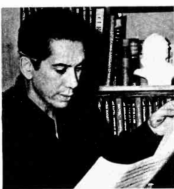
▲ CARMEN CAVALLARO , "Poet of the Piano," will play a thirteen-week engagement on NBC Tuesdays at 5:30 p.m. while "A Date With Judy" vacations.