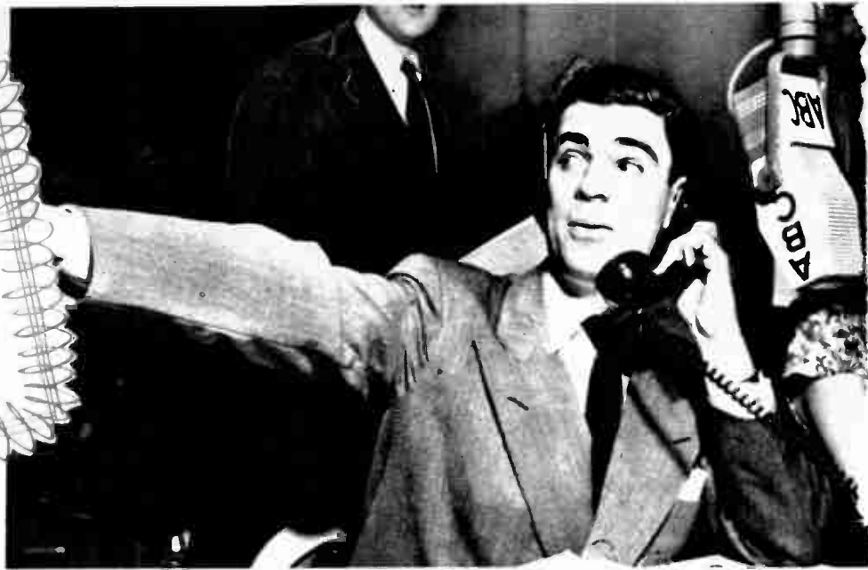
▲ BERT PARKS, EMCEE , stops the music as a listener at home attempts to identify correctly the tune being played.

Is a Signal for at-Home Listeners to Halt Everything and Concentrate on Those Songs. That Lucky Telephone Call May Be for You!