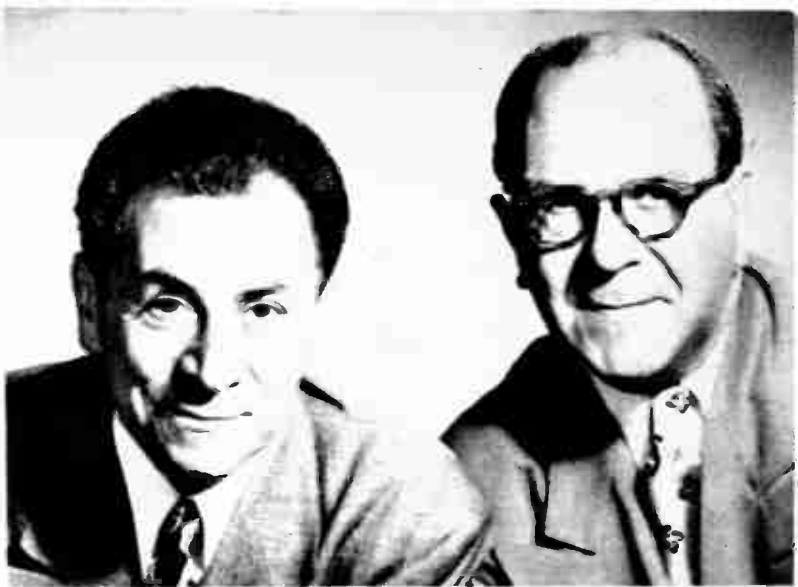
↑ JACK PEARL AND CLIFF HALL, TWO GRAND OLD-TIMERS! They're the joyous choice for "The Great Gildersleeve's" fill, as their well-seasoned humor comes through the air each Wednesday, 8:30 p.m. via NBC.