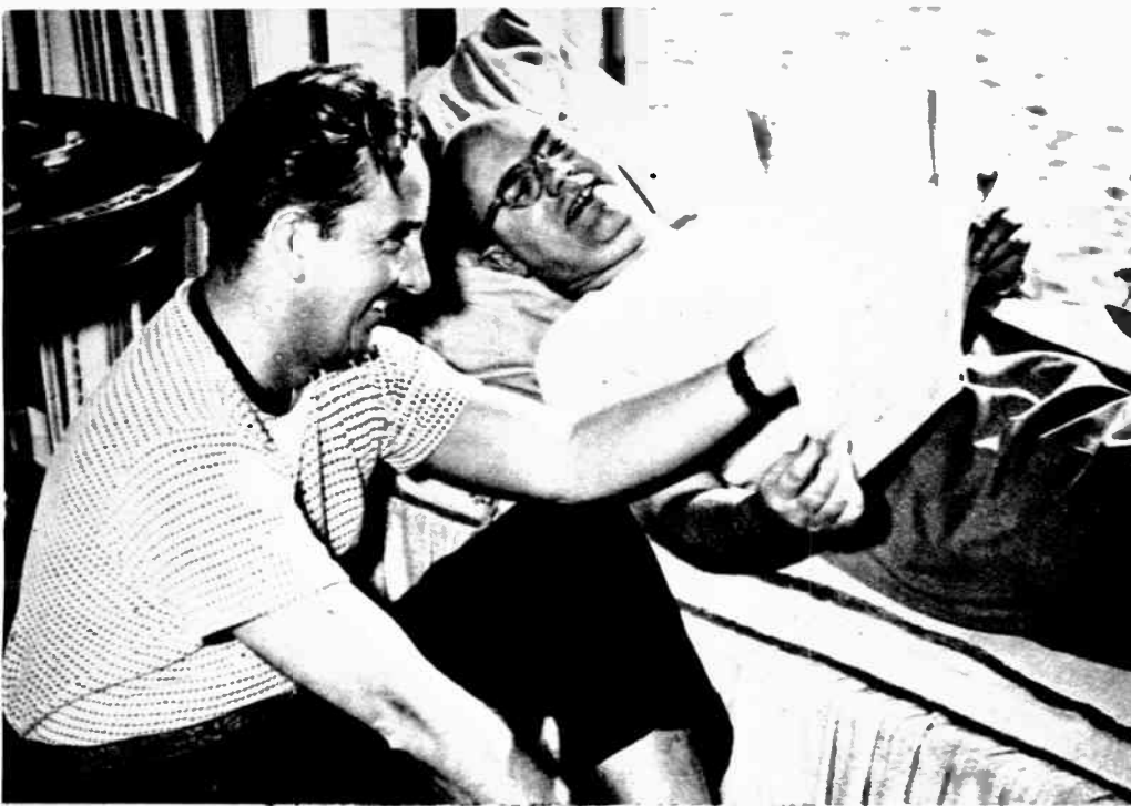
◀ GORDON JENKINS (left) and Tom Adair find the sun porch a pleasant sort of office for many composing sessions. Adair songs include "In the Blue of Evening" and "There's No You." Jenkins signs to "San Fernando Valley" and Benny Goodman's theme "Goodbye." His "Manhattan Tower" will be made into a musical by the two of them this summer.

the profession with some risks and disappointments. He was unable to sight-read when, at sixteen, he took a piano-playing job at the St. Louis Opera House. By valiant concentration, he was able to memorize every note in the complicated orchestrations and give perfect keyboard accompaniment.