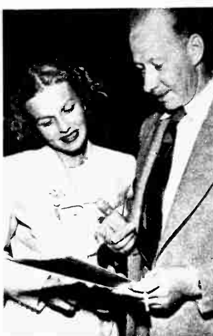
▲ "SEALTEST PRESENTS Ray Noble With Ilene Woods" while Jack Carson, Eve Arden and the "Village Store" folks do a fade from Thursdays on NBC.