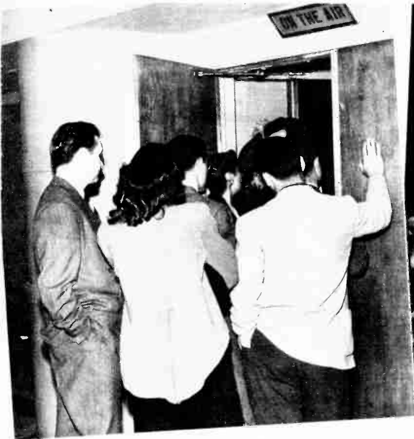
▲ CROWDING AROUND THE STUDIO DOORS to watch their talented USC classmates go through their performances were many interested Trojan students who'd dropped by to see what it's like in a big-time radio audition. Two days of campus try-outs had preceded selection of thirteen boys and girls, from which group four were finally picked for the Sunday broadcast.