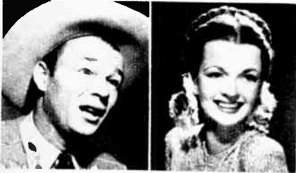
Roy Rogers Dale Evans

Sirs: I am a Roy Rogers fan, and I sure would like to know if his program is coming back. If so, what time and what program? I think the program is perfect with Roy Rogers,