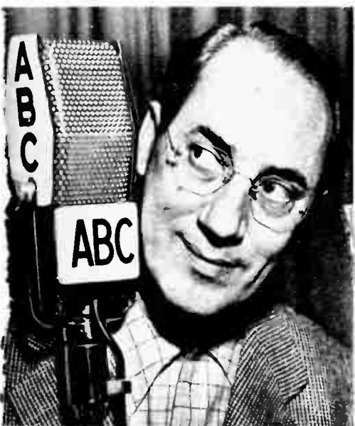
GROUCHO MARX, minus his famous mustache-eyebrows-cigar trademarks, looks just like any other nice guy bent on giving away a carload of money.

MARX, IN HIS famous movie make-up, looks as if he might be entertaining thoughts of latching on to those prizes himself.