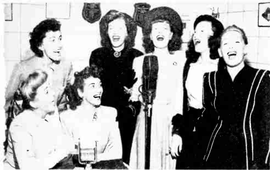
▲ JARVIS CONCEDES THAT LISTENERS TUNED IN to hear the jockeys, not the records, when big-name record and radio talent moved in to "Make Believe Ballroom" during his air vacation. The Andrews Sisters, Patty, Maxene and LaVerne, invited the King Sisters, Luise, Donna, Alyce and Yvonne, as their guests during a record stint.