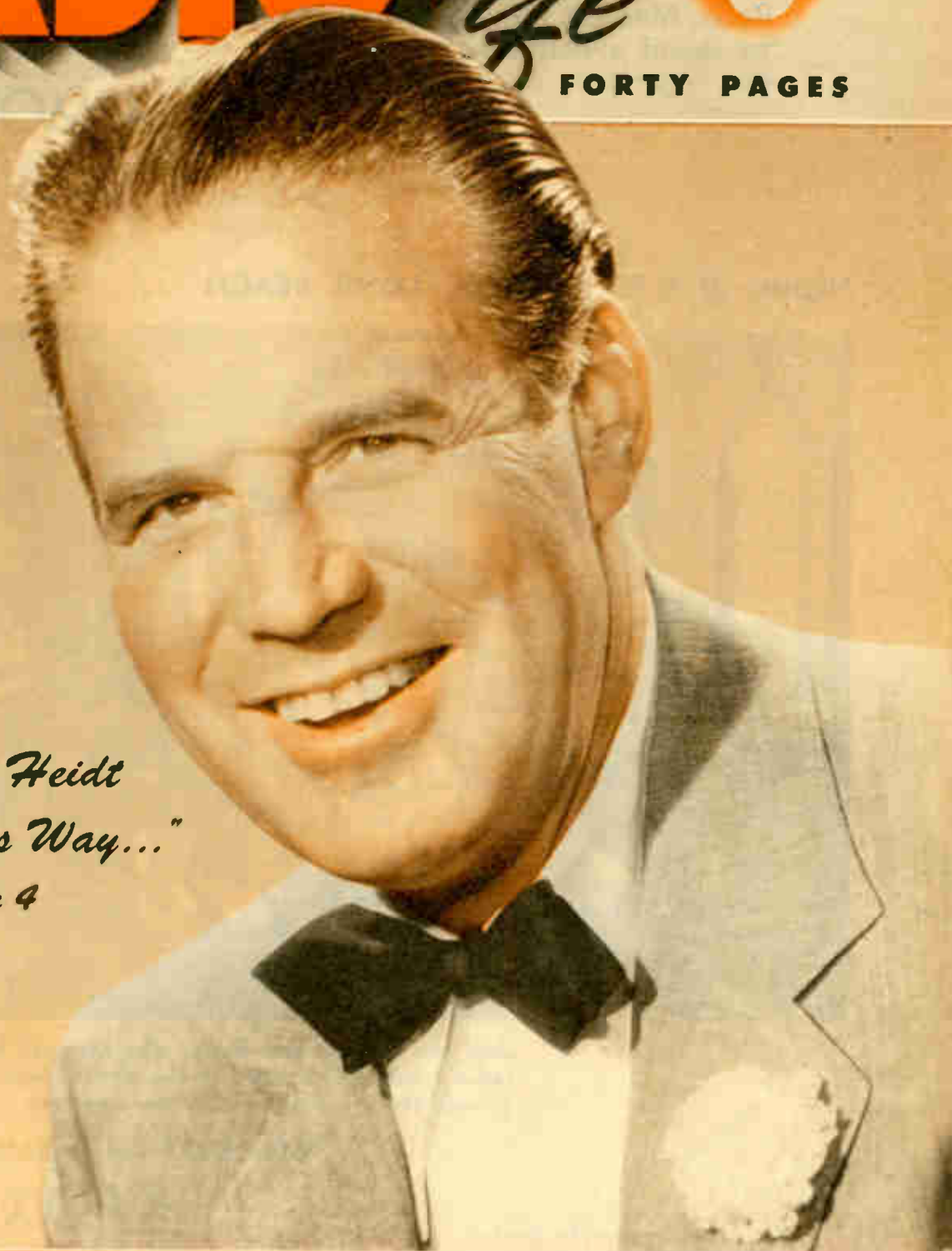
Horace Heidt "Right This Way..." Page 4