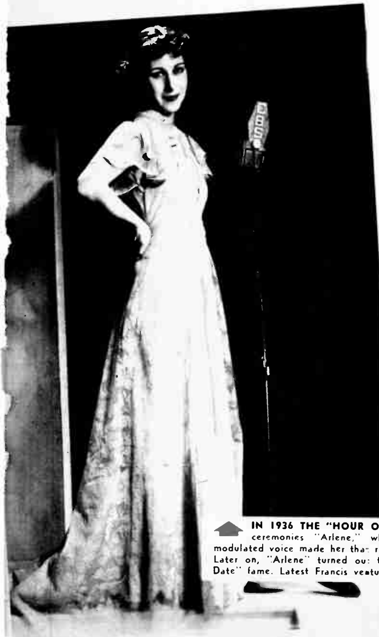
▲ IN 1936 THE "HOUR OF CHARM" had as mistress of ceremonies "Arlene," whose pleasant and beautifully modulated voice made her that rarity, a popular lady announcer. Later on, "Arlene" turned out to be Arlene Francis of "Blind Date" fame. Latest Francis venture is the movies.