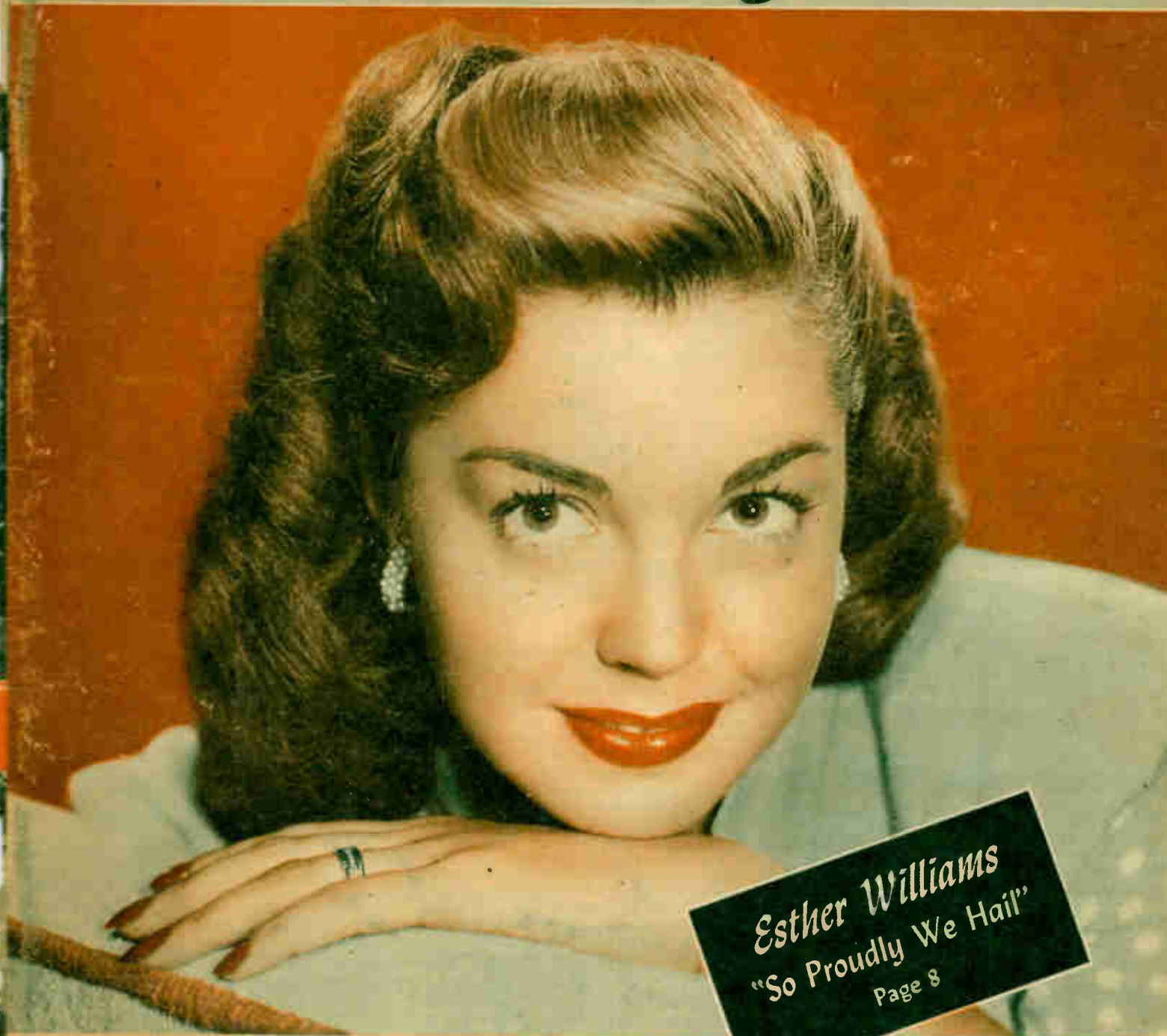
Esther Williams "So Proudly We Hail" Page 8