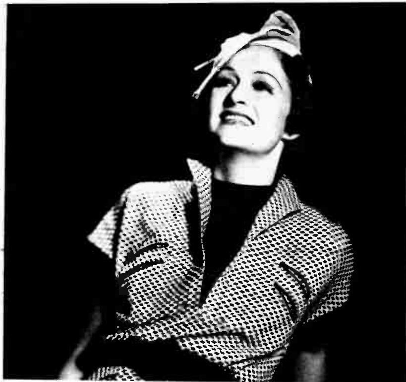
▲ LEADING LADY IN EDDIE CANTOR'S "Whoopie," vocalist with George Olsen's orchestra and singing star of Jack Benny's first air show in 1932 was blonde Ethel Shutta, now a night club name.