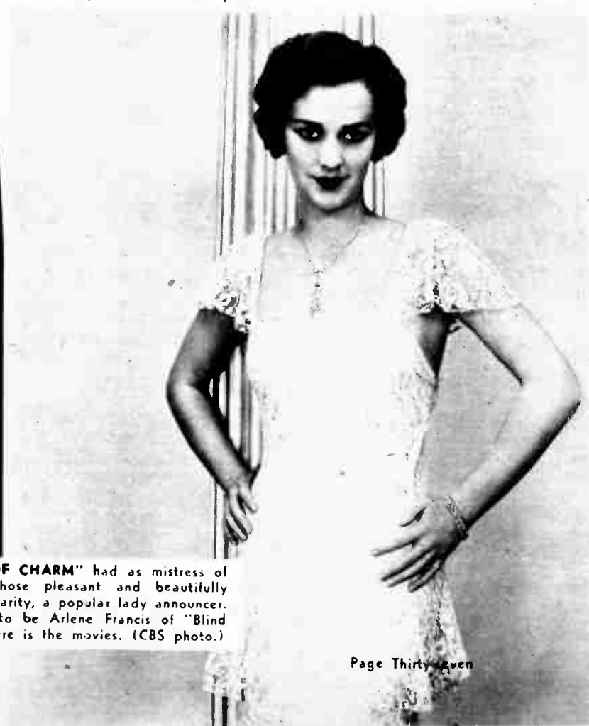
▼ IN 1934 ONE OF THE BEST-KNOWN VOICES on the air was that of Jane Froman. Seriously injured in the Lisbon Clipper plane crash while en route to Europe to entertain troops, Jane fought her way back to health and New York supper-club stardom.