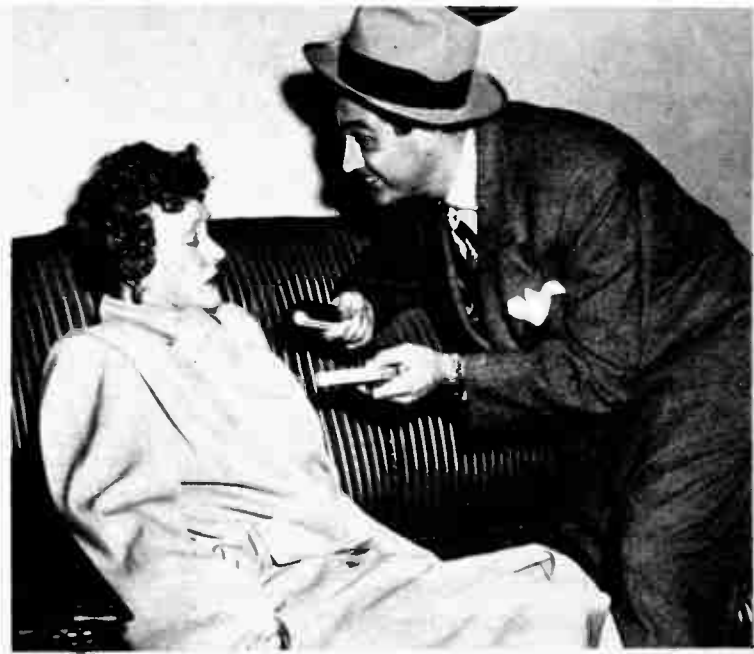
▲ MORE THAN SEVENTY-FIVE HOLLYWOOD stars have been used on "So Proudly We Hail," among them Turhan Bey (above), but no stars have been repeated to date.