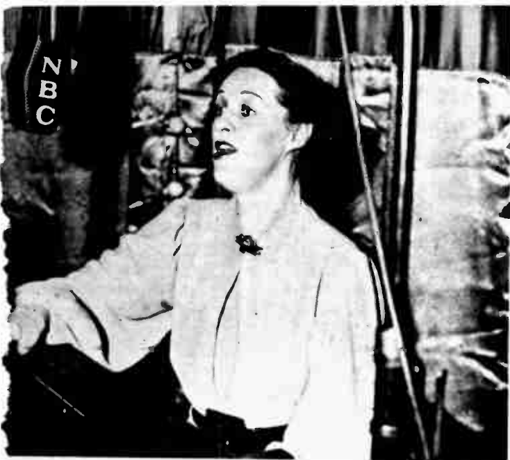
▲ REMEMBER THE LOW, SULTRY VOICE of Paul Whiteman's clever young songstress, Ramona? Possessor of one name and two talents, Ramona played the piano in the same torrid vein as she sang back in 1935, when this was taken.