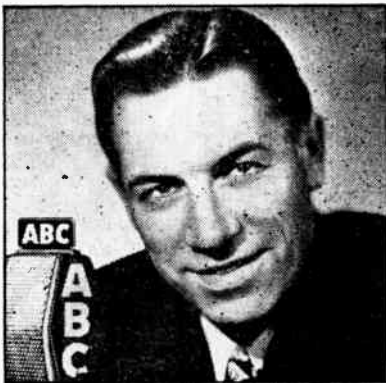
George Beverly Shea