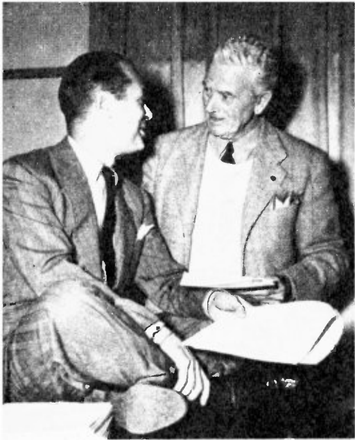
▲ PRESENT DAY STAR Robert Montgomery discusses the industry with silent day star Herbert Rawlinson, who is a member of many distinguished air casts.

"Cavalcade" calls Hollywood its home, though much of the time the "Cavalcade" show is broadcast from New York. This year the program will visit other U. S. towns. Its sponsor, Du Pont Company, has many plants all over the country and the idea of bringing stars to some of the towns which ordinarily never see them will be a summer project. In May the program returns to New York to take advantage of Broadway names available for broadcasts.