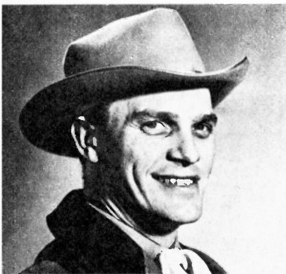
▲ NEW EMCEE OF Mutual's "Checkerboard Time", program featuring old-time folk music and comedy, is Eddy Arnold.