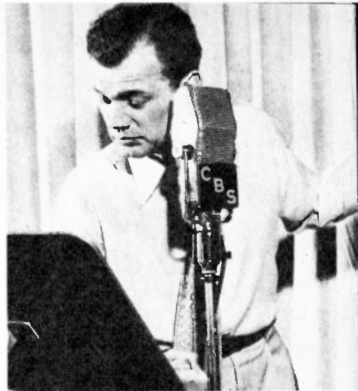
▲ ALWAYS A WELCOME guest on the airlines is Joseph Cotten, who recently appeared on "Suspense" in "The Thing in the Window".