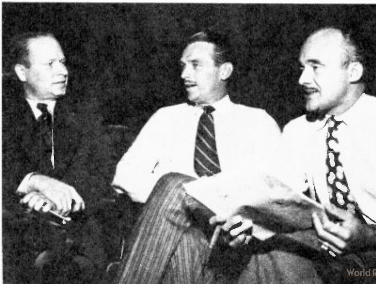
▼ YOU TRY TO RELAX during rehearsals, and what happens? —you get interviewed. In this case it's a representative of the A. P. news service who nails star Douglas Fairbanks and the producer.

The bright talent of Broadway, though it's inspiring to the listener, can be a headache to a radio producer, according to Zoller. Don't get him wrong, Broadway luminaries are swell folks, but they're so darn busy. "The eastern broadcast goes on the air at eight o'clock and curtain time for most Broadway stars is eight-