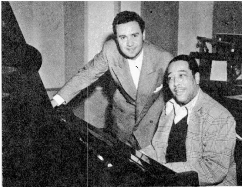
DUKE ELLINGTON OFFERS a sample and personal program notes on his "Perfume Suite", introduced on the air on "Eastside Serenade"