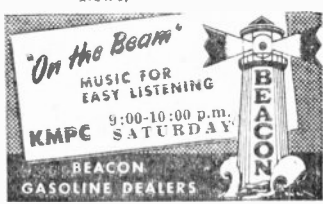
KMPC—On the Beam.