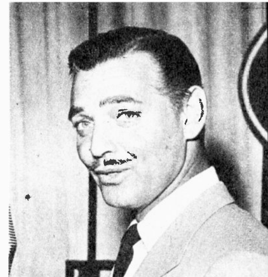
▲ CLARK GABLE MADE his first radio appearance out of uniform on the "Cavalcade" show. Tickets, of course, were at a premium and those lucky enough to rate them were very happy folks—until the show went on the air. Clark played the part of a submarine officer and spent most of the program speaking from off-stage in an isolation booth.