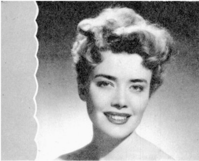
↑ SOCIALITE-ACTRESS CATHRYN CRAGEN looks like one of the many college students who form the greater part of her nightly listening audience on the Universal International Studio-sponsored hour of music.