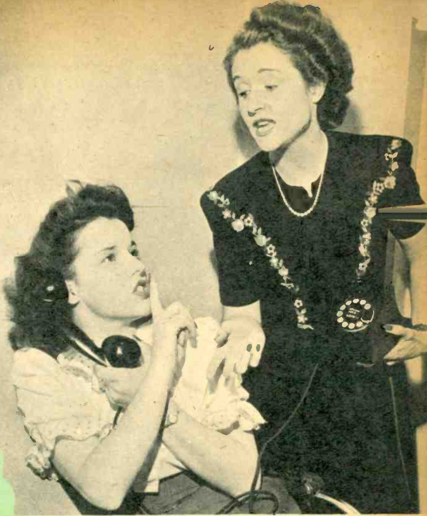
FOR TWO YEARS, charming red-haired Irene Tedrow has mothered CBS' incorrigible "Corliss Archer" (portrayed by Janet Waldo; at phone, above). Now, Irene is beaming over her very own six-months-old "blessed event" (inset, at left).