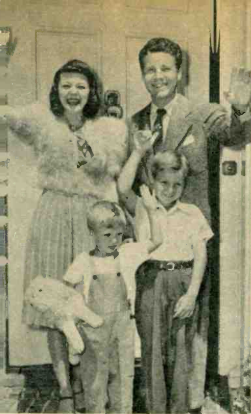
▲ HARRIET AND OZZIE'S ADVENTURES never cease with two lively young sons ruling the roost at the Nedson home, four-year-old Eric Hilliard and seven-year-old David Ozzie.