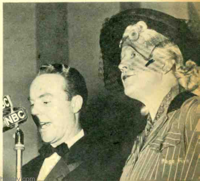
▼ THERE ARE TWENTY-ONE DIFFERENT kinds of consequences so far listed by Edwards for his show. Four or five comprise a broadcast. The "lady" with Ralph at the mike is Rudy Vallee, who assisted in one of the gags. (Note Edwards' tuxedo—he and cast members always dress up for show, Edwards maintaining three tux outfits all the time as they are constantly being ruined during the merriment on the program).