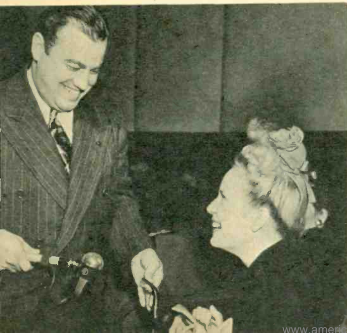
▼ A VISITING OKLAHOMAN CACHED HER toothbrush and toothpaste in her bag. "It was simpler," she explained.