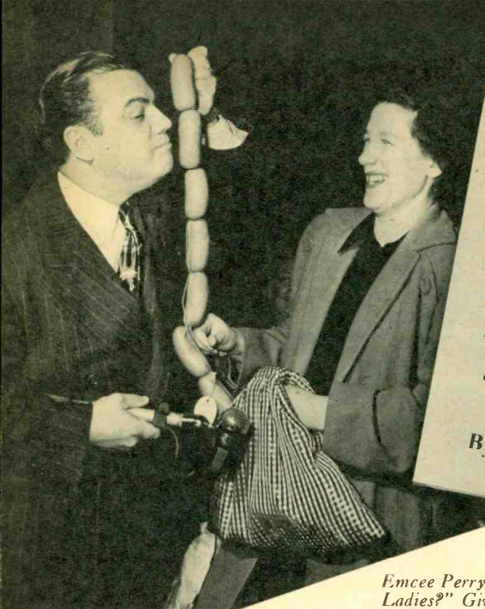
—Sterling Treavor Photos