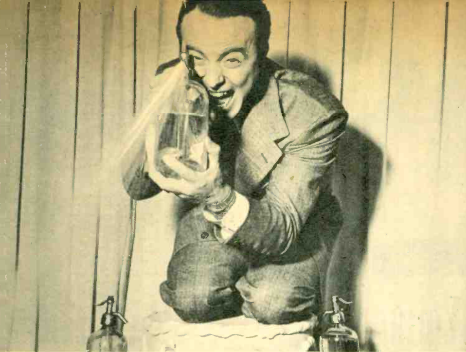
▲ "FIZZ IN YOUR EYE," says the noted emcee as he kneels on the cake marking his show's fifth anniversary, February, 1945. Edwards often gets squirted with seltzer, once fell in a water tank on the stage, took consequences blithely.