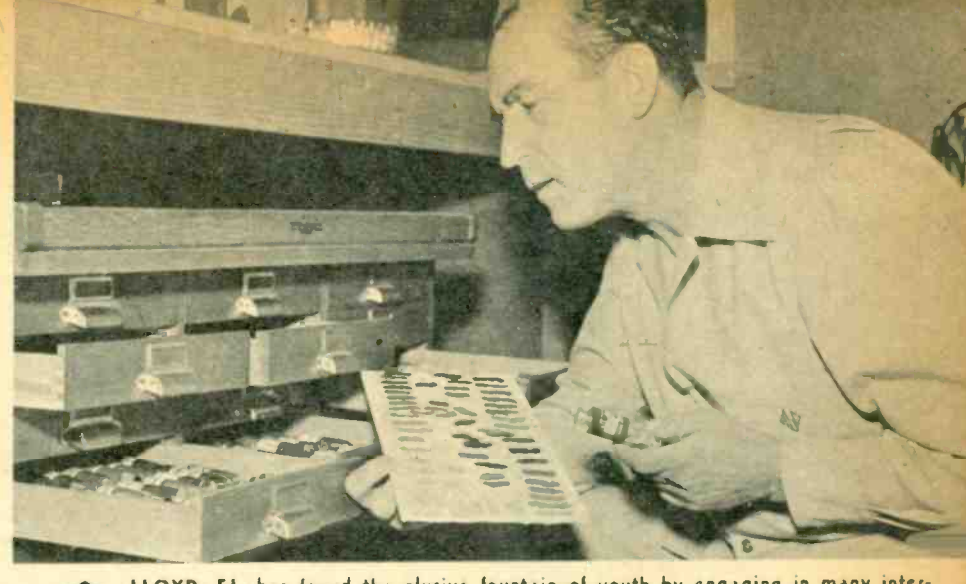
esting activities including sports and art. Here he is shown matching some oils in his basement "studio."

Lloyd house is to give an instrument to each of half a dozen persons and let the group analyse a strawberry, a leaf, or some other simple object.