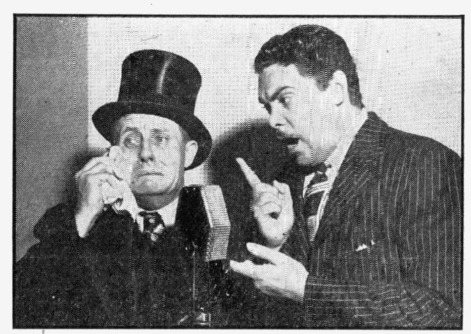
Fast becoming one of radio's top comic duos is the Bert Wheeler-Hank Ladd combination. As the "heavy," playing straight man to the diminutive Wheeler, Ladd is continually bawling out 'the little man' who sons away with the audience's sympathy.