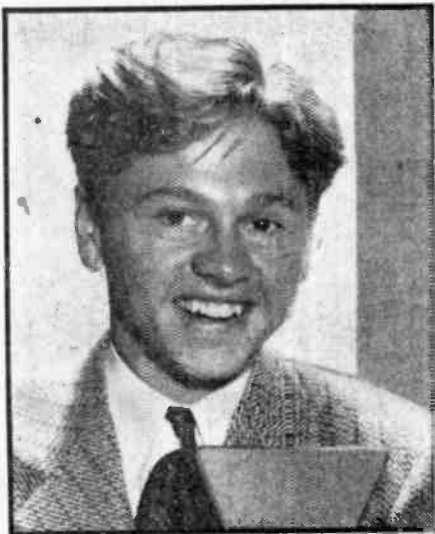
Dynamic young Rooney substitutes this week for Bing Crosby on Kraft Music Hall. Abundance of sparkle is guaranteed. See Pre-Cast page 15.