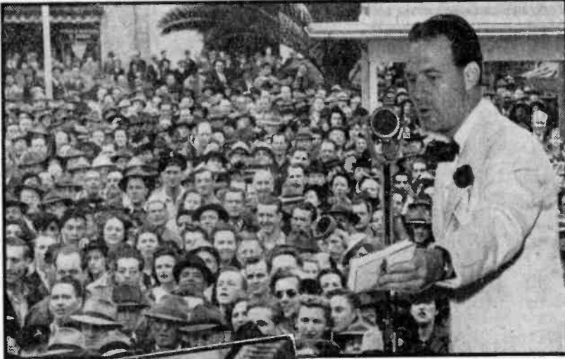
Treasure Chest Maestro Heidt sells Defense Stamps at Defense House, Los Angeles, in preview of the idea which will feature his nationwide tour.