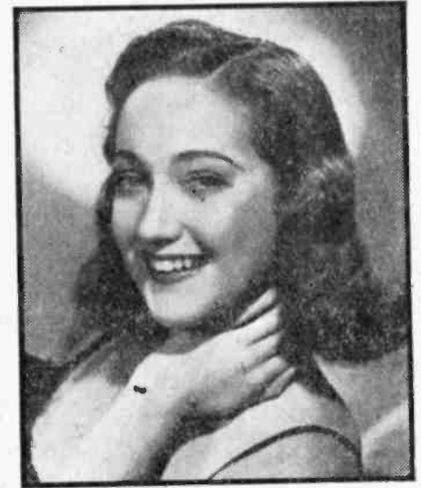
Back to microphoning after touring the country as a defense bond saleslady for Uncle Sam, Dorothy Lamour is slated for Silver Theater. See Pre-Cast this page.