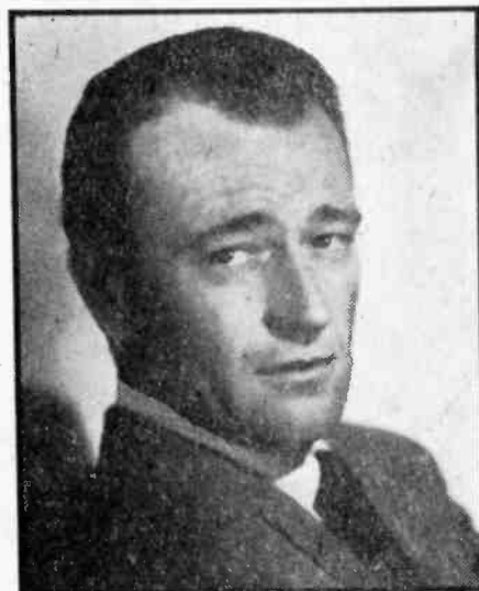
John Wayne, virile out-door hero of films, makes radio debut as leading man of Tay Garnett's first radio series. See Pre-Cast this page.