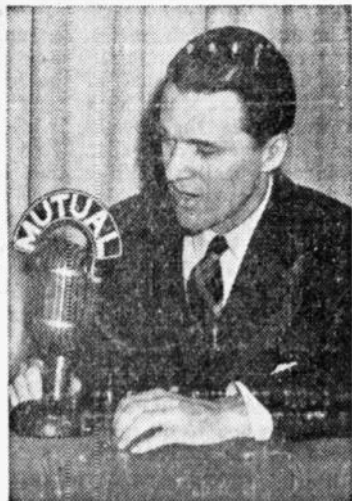
Don Dunphy, able young New York sportscaster, selected to do the blow-by-blow descriptions of the exclusive boxing bouts to be heard over KHJ and the coast-to-coast Mutual Don Lee Network, sponsored by the Gillette Safety Razor Company. His first assignment was the Louis-Corn heavyweight tussle. Press comment on Dunphy's work in the network airings has been full of praise. Dunphy was chosen by the sponsor after live and recorded auditions of 30 other announcers had been heard, and applications of some 30 more had been studied.