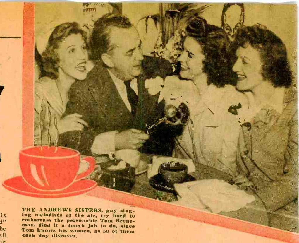
THE ANDREWS SISTERS , gay singing melodists of the air, try hard to embarrass the personable Tom Breneman. find it a tough job to do, since Tom knows his women, as 50 of them each day discover.

T HE AMAZING Mr. Breneman is M.C.'ing "Breakfast on the Boulevard" and is obviously in his element as he cavorts before 60 gardenia-ed women, all in expansive mood from just finishing toast and eggs at world famous Sardi's. Nervously he strides from table to booth, his keen eyes singling out ladies who indicate promise of being quick on the verbal up-take; he levels an accusing finger at one and demands, "Did you ever milk a cow?"; he pounces on another and booms, "Did you ever see a discontented cow?"; he whisks over to another, pokes the hand-mike under her chin and probes, "What was your first embarrassing moment?"; he rumbles a deep bass as he leads a song; he's in a tight spot and mops his forehead; he's pleased, gives a quick, chummy wink and rubs hands together briskly; in short, he's a one-man show and the ladies eat it up.