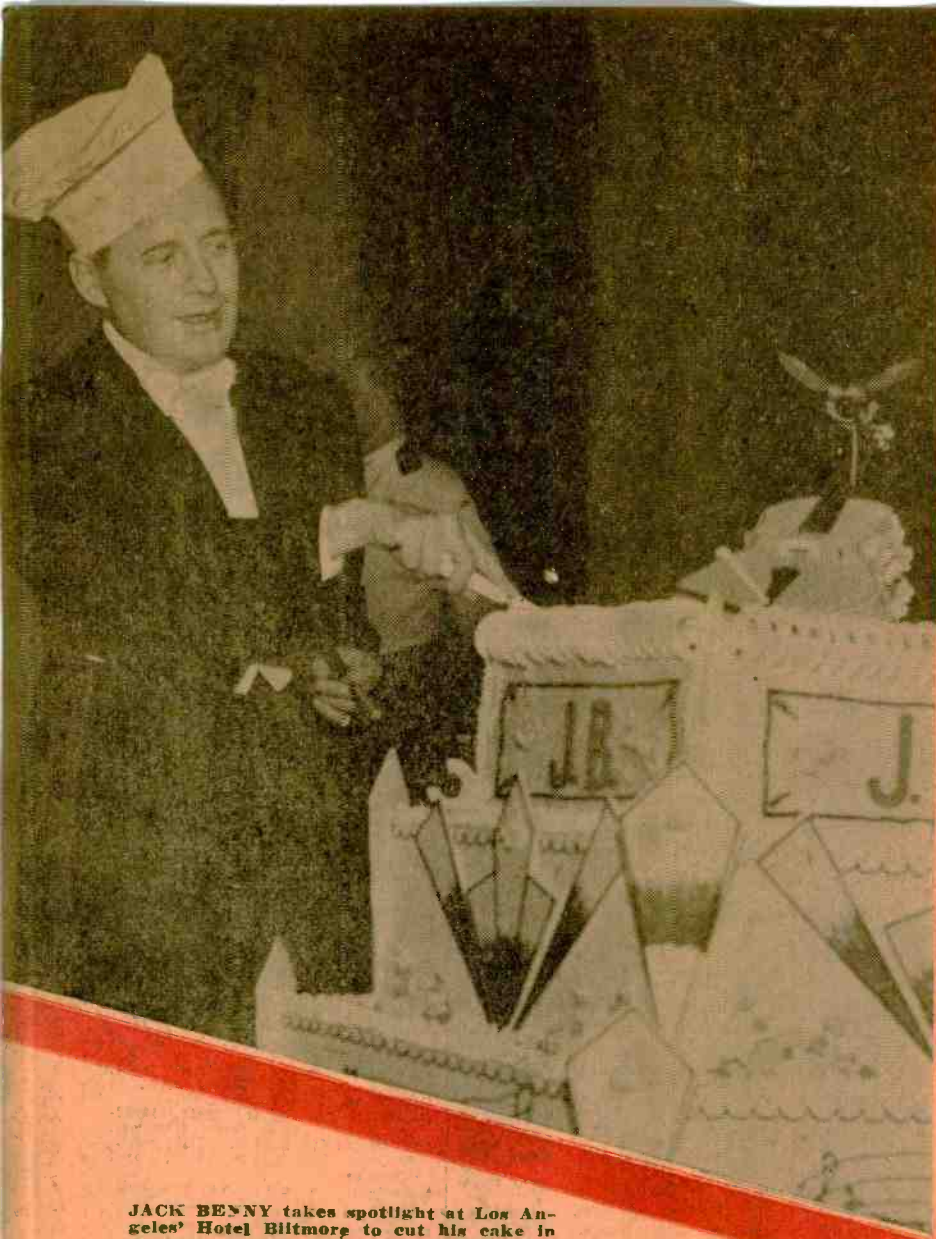
JACK BENNY takes spotlight at Los Angeles' Hotel Biltmore to cut his cake in presence of 2,000 luminaries of entertainment's world.