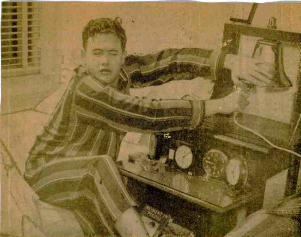
HERE'S a typical morning scene with Bob Garred, CBS newscaster. From this to the handsome gentleman at bottom center column is just a matter of assorted alarm clocks, sighs, yawns, healthy reluctance to start the day.