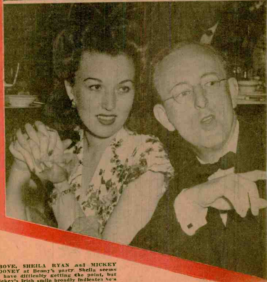
ABOVE, SHEILA RYAN and MICKEY ROONEY at Benny's party. Sheila seems to have difficulty getting the point, but Mickey's Irish smile broadly indicates he's ahead of the narrator. Below Virginia Simms and Kay Kyser, the inseparable of whom there is much romance talk.