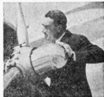
Boake Carter, famous radio news commentator, is back on the air in a tri-weekly program heard at 9:30 p.m., PST, on Mondays, Wednesdays and Saturdays over KHJ and the Mutual-Don Lee network. Carter, a former Royal Flying Corps pilot, is shown exercising his lively curiosity on a Wnsp engine. Carter's broadcast is sponsored by the United Airlines.