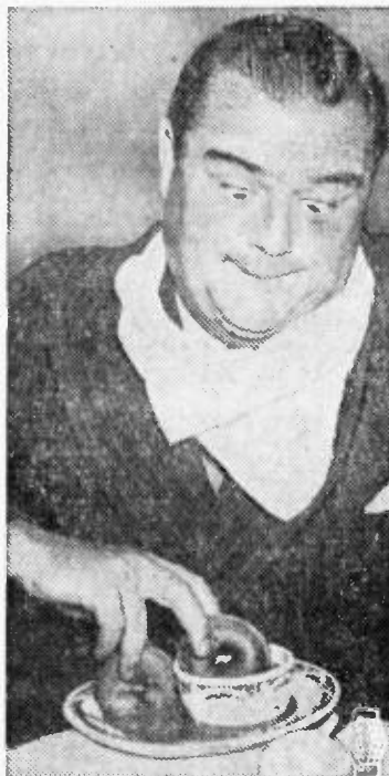
National Donut Week. Just ended, inspired Columbia network's ingenious inventor, Col. Lemuel Q. Stoopnagle, to devise this patented "Double-Dunk" method of immersing two of the "holesome" goodies at one and the same time. The Stoopnagle technique employs the thumb and first three fingers, thus allowing the pinkie to be cocked jauntily in the accepted manner of your neighborhood sewing circle. The coffee, of course, is divided evenly between cup and saucer.

program comes." Information scanned the station log, selected a program then on the air with a doctor and a nurse and a "harriidan" of a society girl.