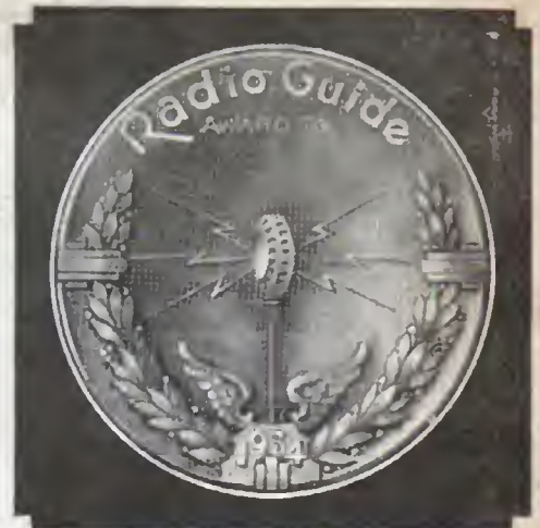
"Burns and Allen"—"Amos and Andy"—whose name will appear in the space allotted on the silver medal (of which the above is a fac-simile of the design) to be awarded the winning team? Is YOUR candidate near the top?

In it you will find a few questions that will help us to get better acquainted. However, your vote will not be invalidated by your failure to answer all the questions incorporated in the ballot. Vote now!