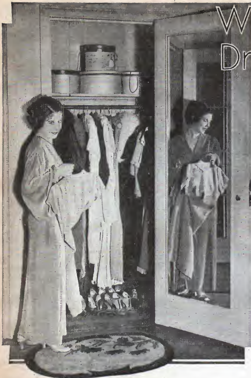
Annette Hanshaw shown at the closet that holds some of her wardrobe. Note the variety in color and design of the dresses that hang—as necessary as that she be in good voice when she broadcasts, she says

SO you think clothes don't make any difference in radio, do you? You imagine radio stars wear any old thing and get away with it because most of their audience doesn't see them? Well, pretty Annette Hanshaw disagrees. And the little girl with the big blues voice ought to know.