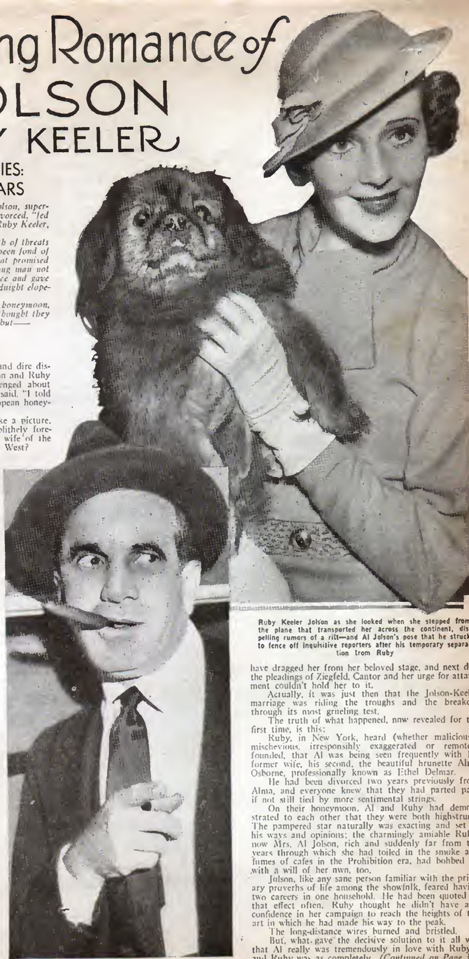
Ruby Keeler Jolson as she looked when she stepped from the plane that transported her across the continent, dispelling rumors of a rift—and Al Jolson's pose that he struck to fence off inquisitive reporters after his temporary separation from Ruby

One day nothing under the big, blue dome could