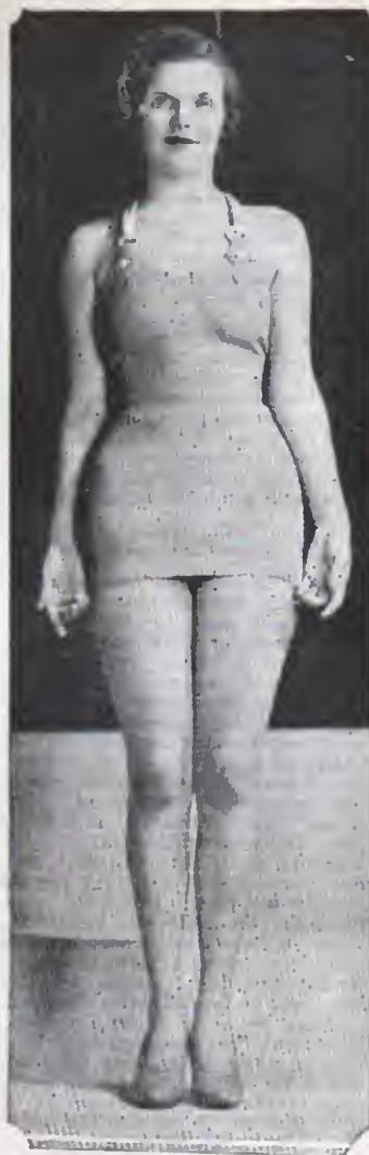
MISS ROID OF 1934