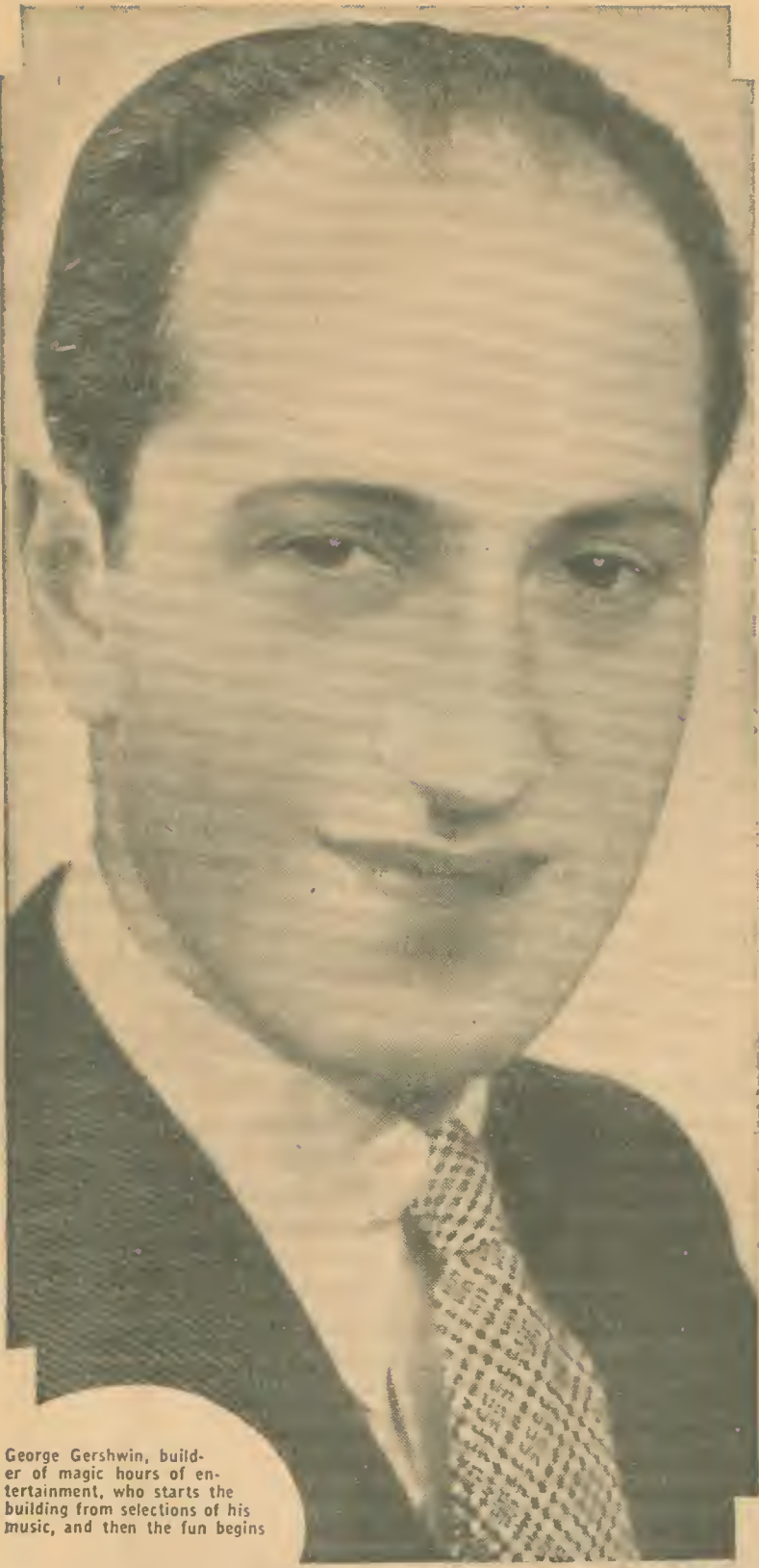
George Gershwin, builder of magic hours of entertainment, who starts the building from selections of his music, and then the fun begins

She came to America a few years ago and became a chorus girl. Just after being "fired" by the producer, he heard that she could sing. He asked that she sing for him, with her own guitar accompaniment. Immediately she was engaged again—but not to sing!