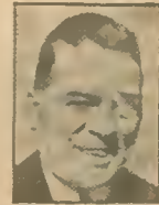
FLOYD GIBBONS Famous Radio Broadcaster

IT ISN'T necessary to be a "star" to make good money in Broadcasting. There are hun- dreds of people in Broadcasting work who are practically un- known—yet they easily make $8000 to $5000 a year, while, of course, the "stars" often make $25,000 to $50,000 a year.