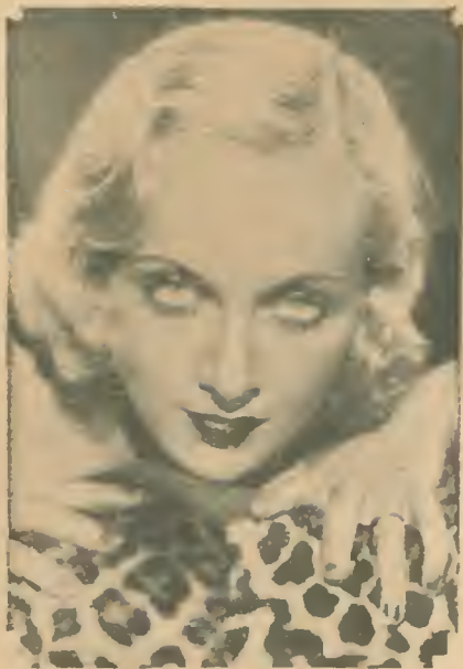
Carol Lombard, movie star, will be guest artist on Bing Crosby's Monday night CBS- WABC network, at 8:30 p. m. EST, April 2