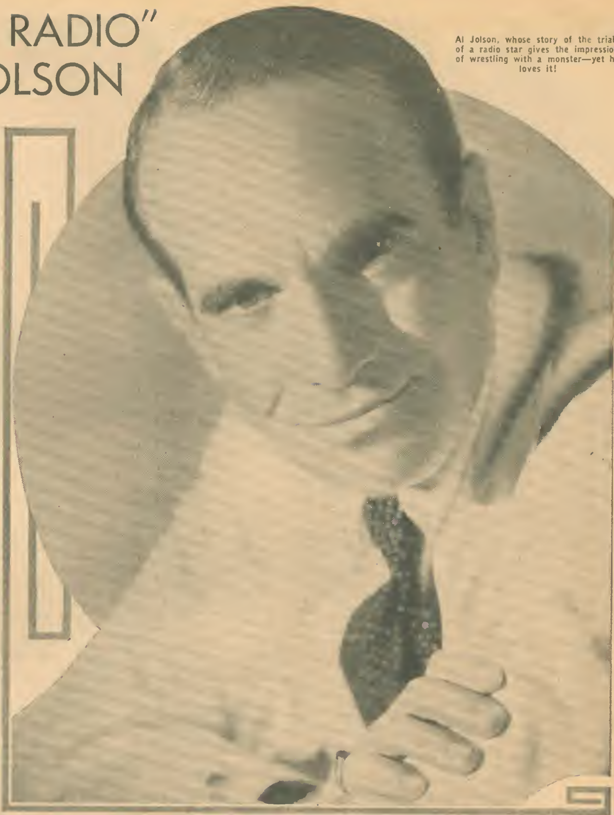
Al Jolson, whose story of the trials of a radio star gives the impression of wrestling with a monster—yet he loves it!