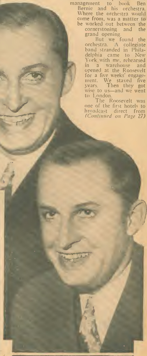
"The Ole Maestro" in a series of exclusive camera studies—"I see you peeking, Winchell," "Fo'give me, fo'give me," "The mosta of the besta," and "I hope you like it"