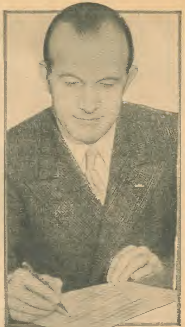
The Voice of Experience examining some of the letters readers have sent to him in answer to other readers' problems

Then write a solution letter not more than two hundred words long, written on one side of the paper only. Mail it, postmarked not later than April 10, to The Voice of Experience, in care of RADIO GUIDE, 551 Fifth Avenue, New York, N. Y. RADIO GUIDE reserves the right to print any letters received.