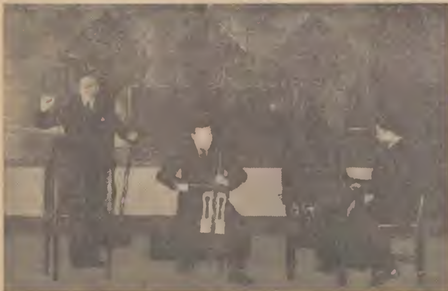
The three instruments shown above form the Theremin Electro-Ensemble, heard in weekly broadcasts over Columbia.