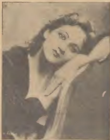
Connie Boswell, who forms one-third of the Boswell Sisters trio, heard on Columbia.