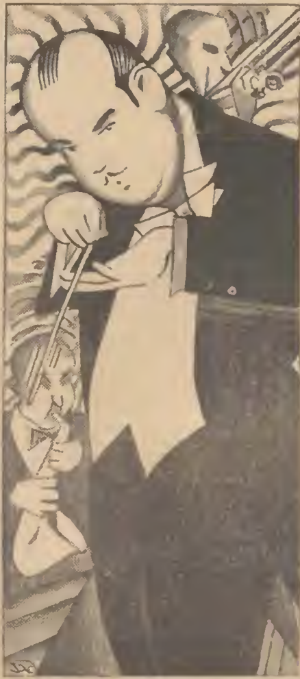
Our artist's impression of Paul White-man, who is appearing all this week at the RKO Palace Theatre.

Roosevelt Theatre —Those of you who assiduously trace the destinies of the stars of the tarnished screen know plenty about young Doug. Those of you who don't, will have to be told. He's a great performer, a talented young man whose histrionic activities must be enthusiastically applauded. He appears currently with Joan Blondell in "Union Depot." Almost the entire movie takes place on one set. If you haven't seen "Grand Hotel" you'll thrill to this. If you have seen "Grand Hotel," you'll like this anyway.