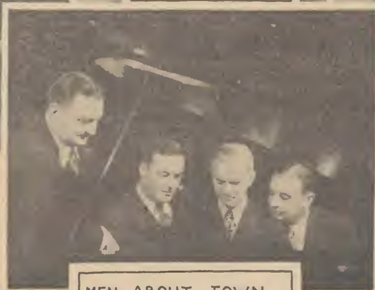
MEN ABOUT TOWN