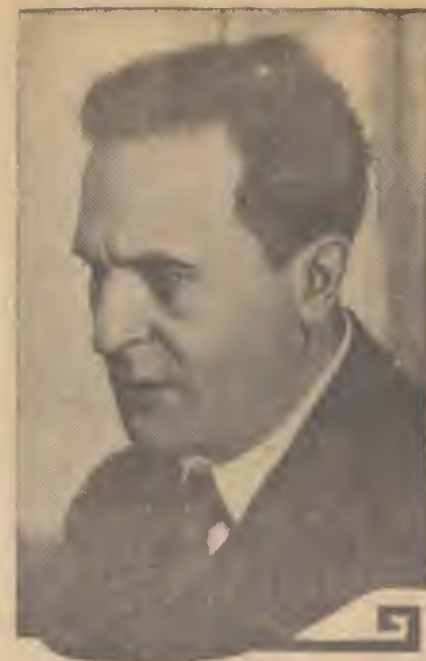
Bruno Walter, internationally famous conductor, who is at the helm during the broadcasts of the New York Philharmonic Symphony Society orchestra over the Columbia network.