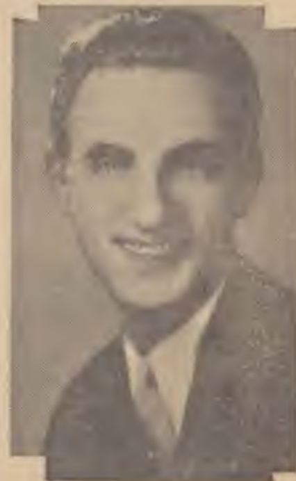
Arthur Tracy, better known as the Street Singer, is now appearing each Friday night over Columbia in the "Pillsbury Pageant" program.