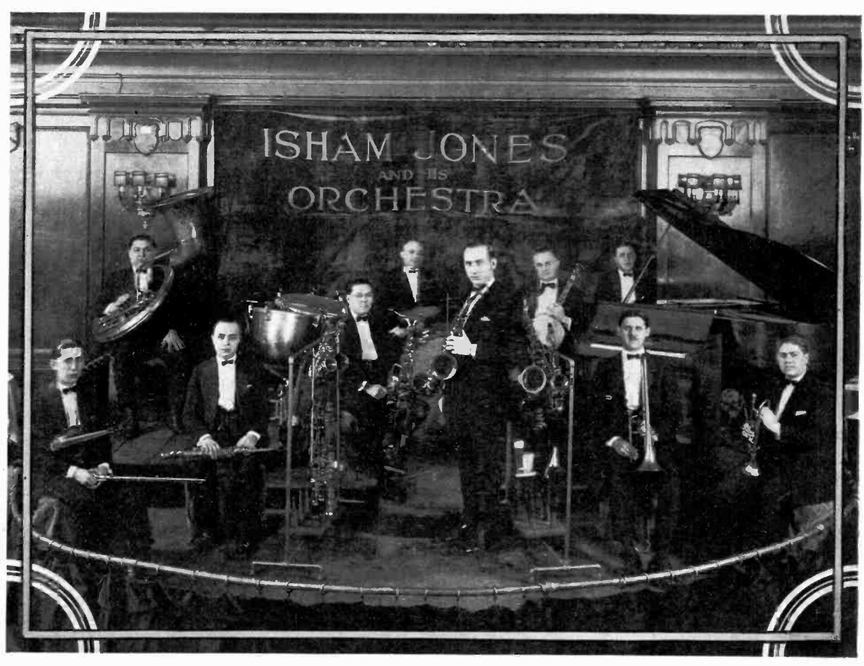
Isham Jones (standing) and his College Inn Orchestra, now playing exclusively for Station KYW, every evening at 8:30. The music is broadcasted direct from College Inn. Hotel Sherman, Chicago, by means of a special wire.