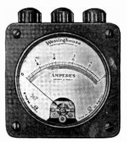
Type PX-3 Ammeter

Member of Radio Section Associated Manufacturers of Electrical Supplies.