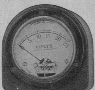
Type PX-2 Voltmeter

These portable instruments are particularly useful for temporary service, such as testing. They are also used where it is not convenient or desirable to mount instruments permanently on panels.