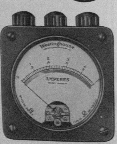
Type PX-3 Ammeter

Member of Radio Section Associated Manufacturers of Electrical Supplies.