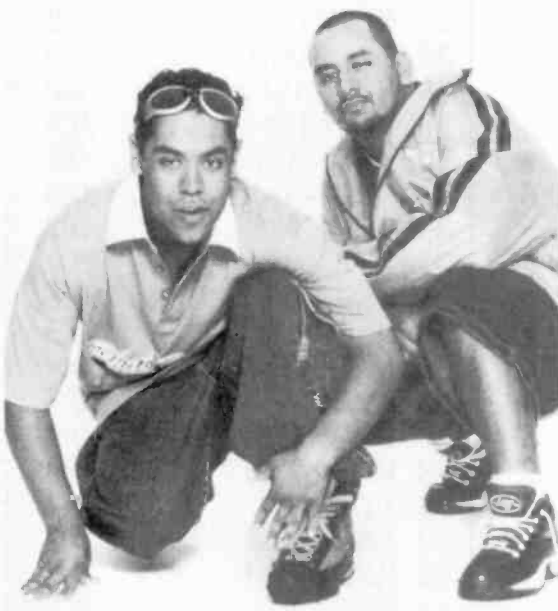
The Baka Boyz of KPWR (afternoons)

Unlike most contemporary music stations in L.A., Power 106 offers various mix shows that enable its DJs to intro-