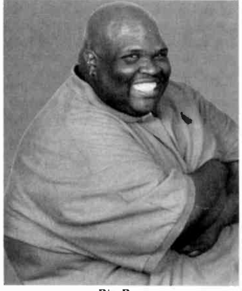
Big Boy 8 — Los Angeles Radio Guide

KPWR 105.9 FM afternoon personality Big Boy sings a version of Mr.