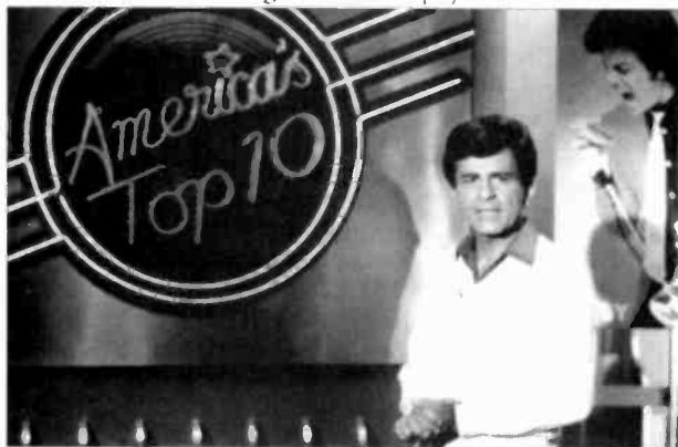
Kasem as 'America's Top 10' TV host (1980-1992)

"It was the perfect thing for me," he said. "In the 1960s, artists were becoming very important, and people wanted to know more about them. But back then, little was written about musi-