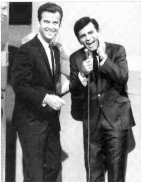
Dick Clark & Kasem on TV's 'Shebang'

About three years ago, top 40 formats began to wane in the marketplace. Kasem saw as many as 1,000 stations drop his show in 12 months. He found that stations were replacing top 40 music with the new adult contemporary sound. Even so, this new format was already fragmented.