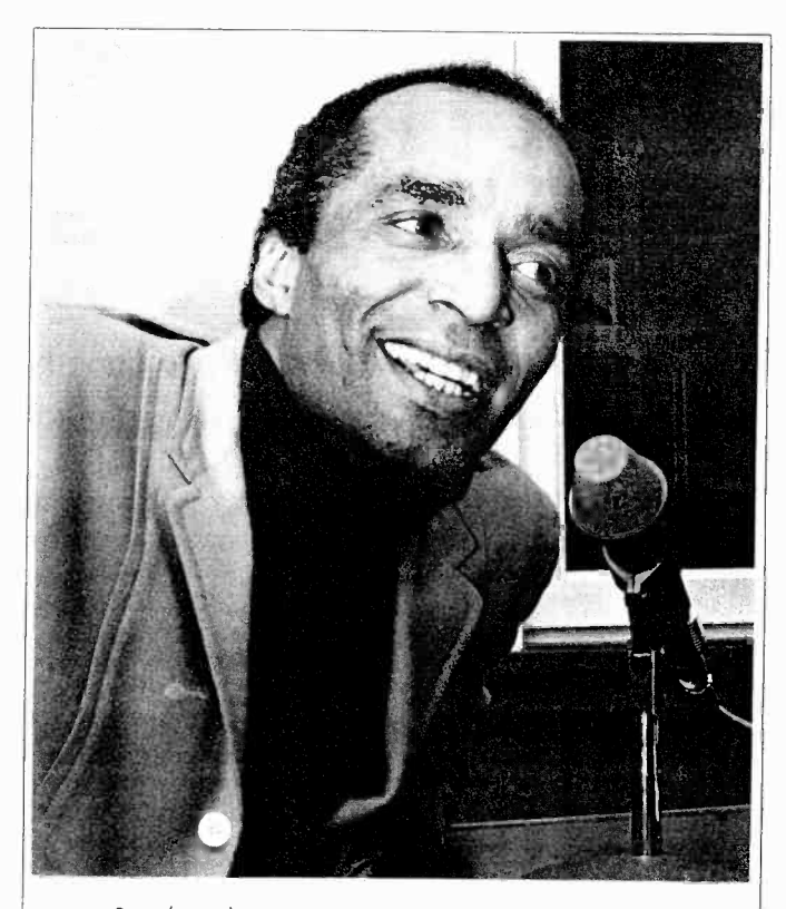
BILL (ROSKO) MERCER, ONE OF THE CURRENT SCENE'S MOST ARTICULATE DISC-JOCKEYS, HAS MOVED TO WNEW-FM WHERE HE WILL BE HEARD NIGHTLY FROM 7 P.M. TILL MIDNIGHT.