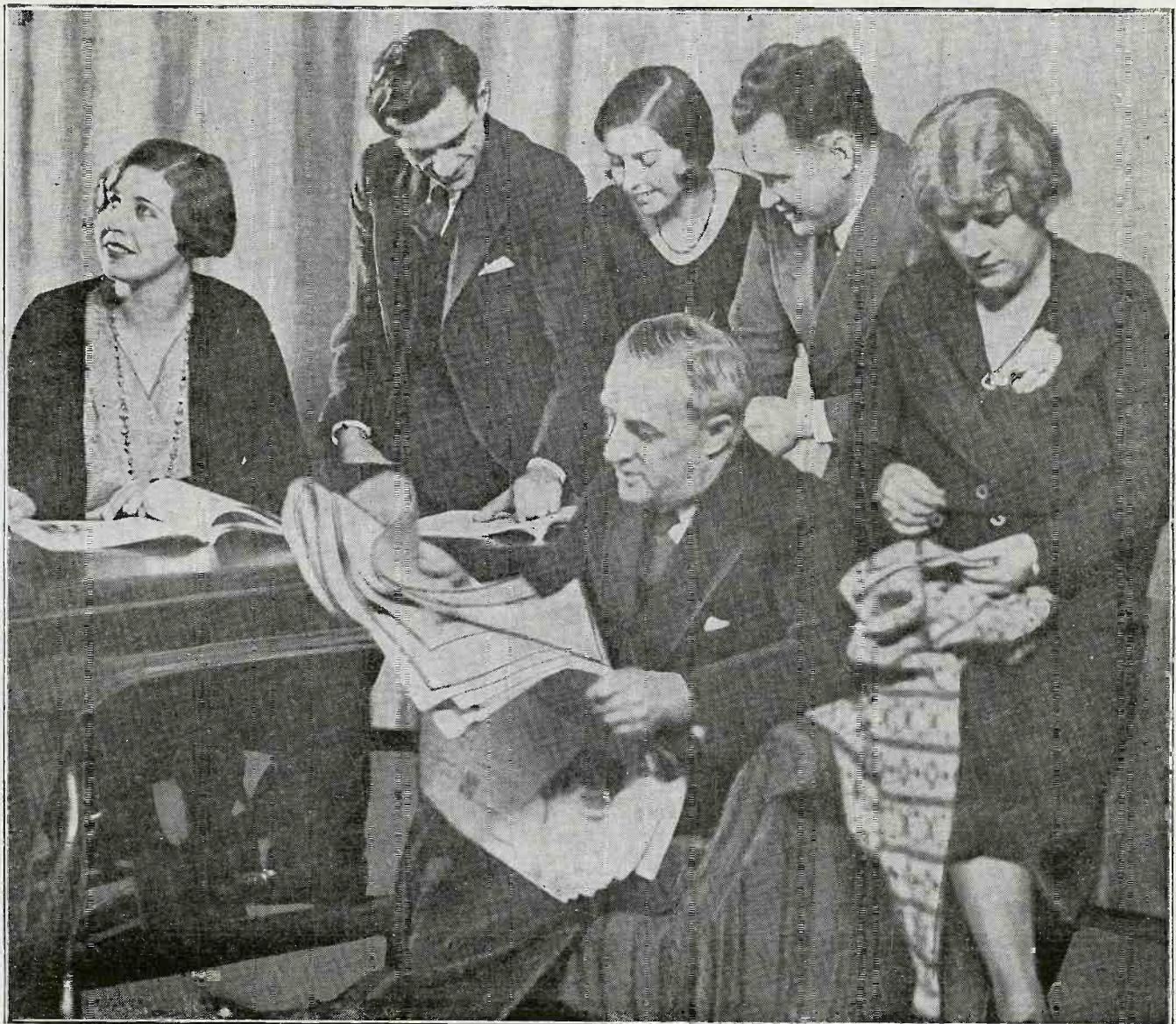
THE SMITH FAMILY—WMAQ AT 8:30 P. M. WEDNESDAY