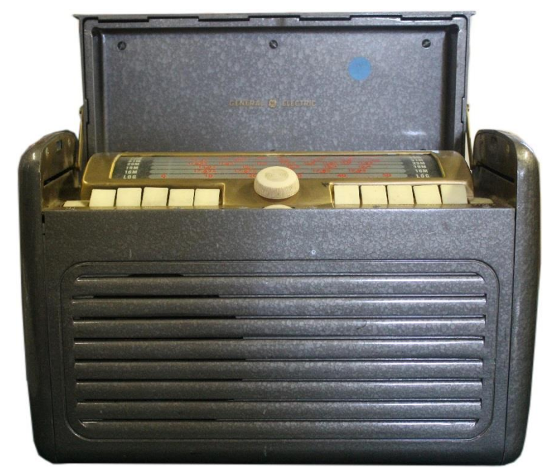
Myron White – 1948 GE Model 260