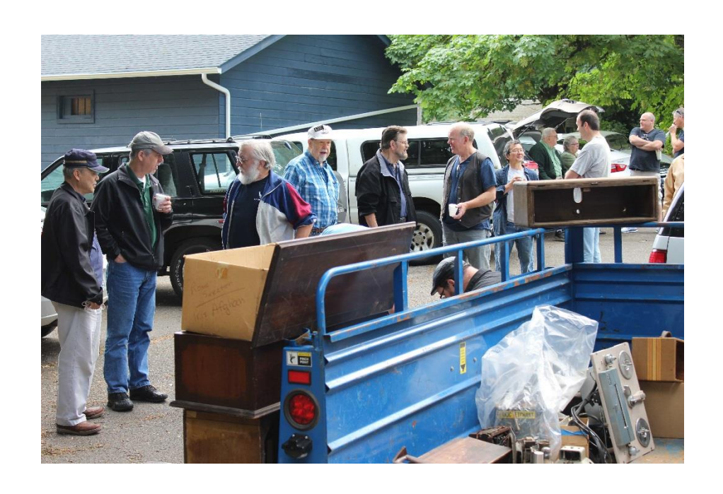
2016 Trash Bash