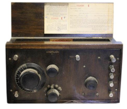
Alan Shadduck - '24 RCA Radiola III and Crosley 51