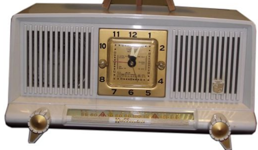
Hoffman Radio Corp Los Angeles Model GP-502C Circa 1954