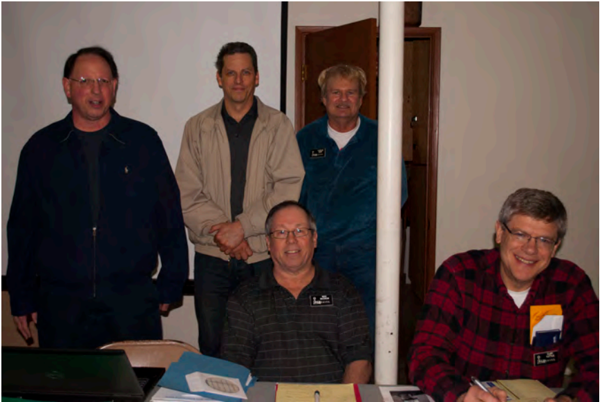
Our 2012 Board of Directors