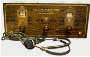
Pilot Super Wasp Alan Shaddock