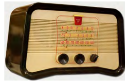
Murphy 152 Myron White