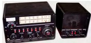
Drake 2-B & Q-multiplier Roland Beebe