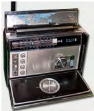
Zenith D-7000 Art Redman

Some of the “Radios with SW Bands” from our March display