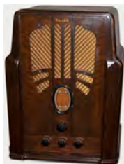
Philco 650 Sonny Clutter