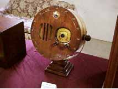
Searchlight - Sonny Clutter