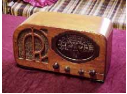
Simplex - Dave Brown