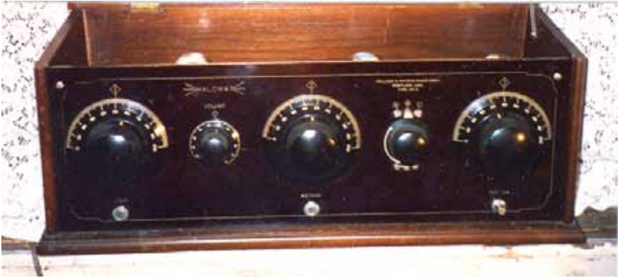
The Author's Halowat receiver