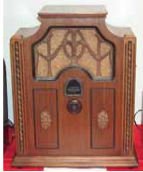
Larry Tobkin -1931 Brunswick