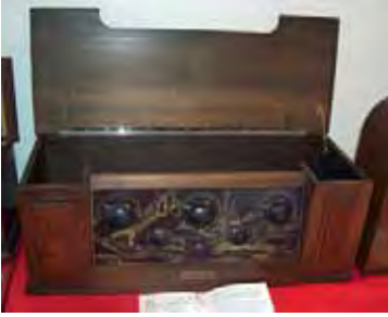
Mike Parker - 1926 Masterphone Illustrated Panel