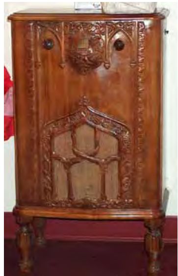
Dick Bixler-Radiola 48