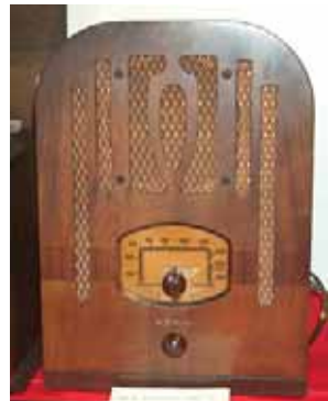
Rudy Zvarich - 1936RCA