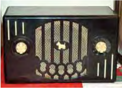
Alan Shadduck - Remler Scotty