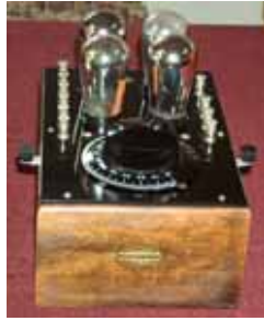
Nightingale - Sonny Clutter