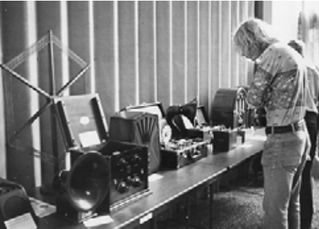
Two views of the 1976 radio display at Concours d'Elegance in Forest Grove.