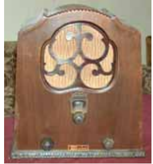
Olympic - Blake Dietze