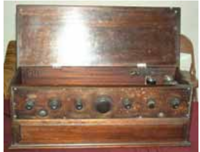
Thermiodyne - Art Redman