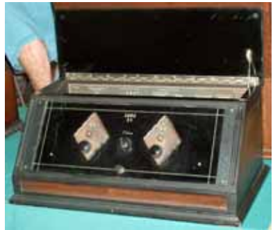
Long-Thompson assembled from parts - Mike Parker