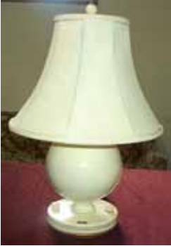
Kristal-lite - Sonny Clutter