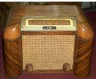
Plymold-Mectron - Jerry Talbott