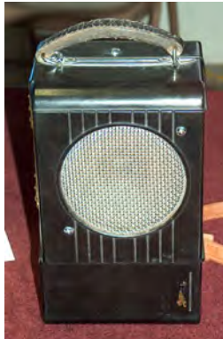
Sonora E4 "Candid"