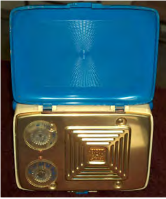
Garod 4B-43 "Starlet"

Portable tube radios, the February feature, brought out a wide assortment of radios.