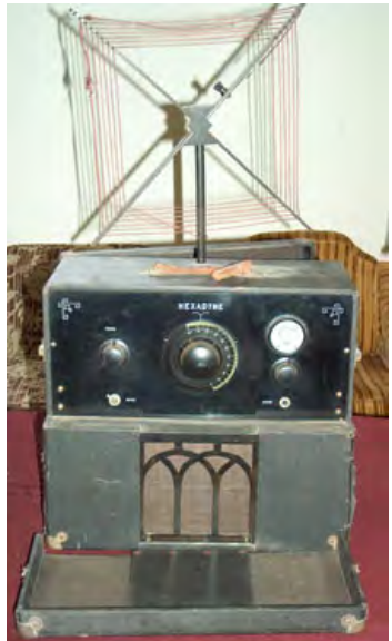
Art Redman - Hexadyne