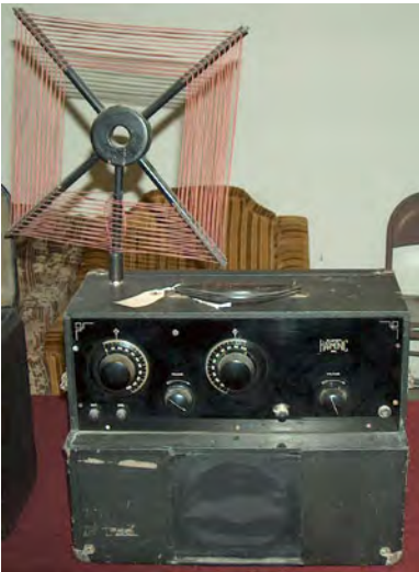
Brian Toon - Kemper