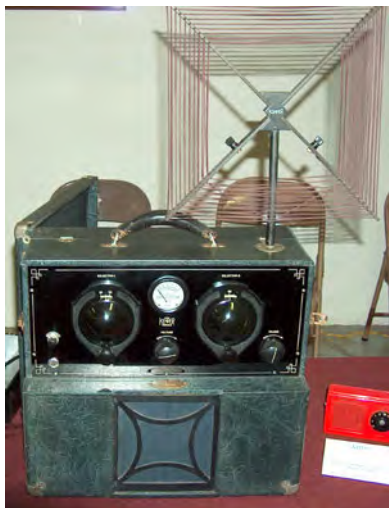
Sonny Clutter - Kemper