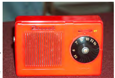
Sonny Clutter Koyo "Parrot" - Japanese