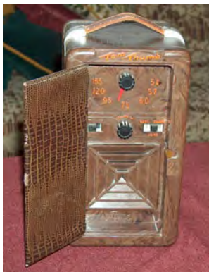
Mystery Owner - Tom Thumb