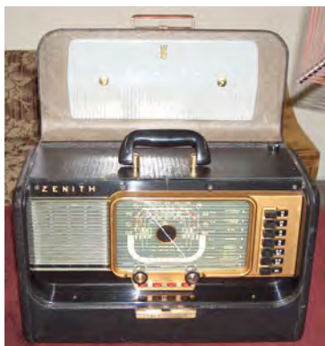
Mystery Owner - Zenith Transoceanic