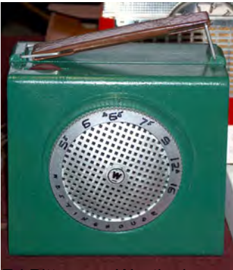
Ed Pittaway - Westinghouse