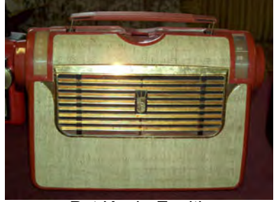
Pat Kagi - Zenith