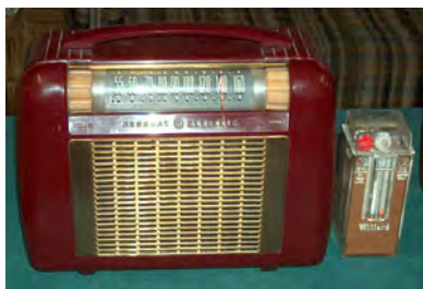
Rudy Zvarich - Three GE Portables