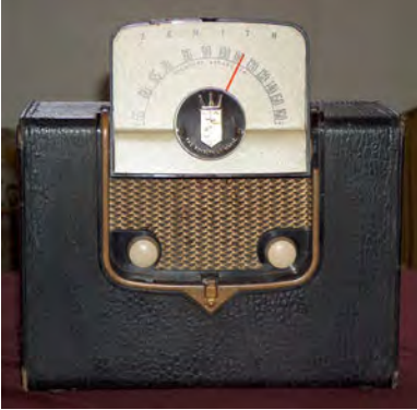
Larry Tobkin - Zenith Flip-front