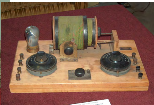
Jerry Talbott - modified AC Gilbert 1-tube kit with loose coupler