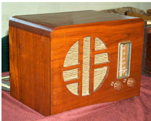
Tony Ranft - 8-tube homebrew with tuning eye