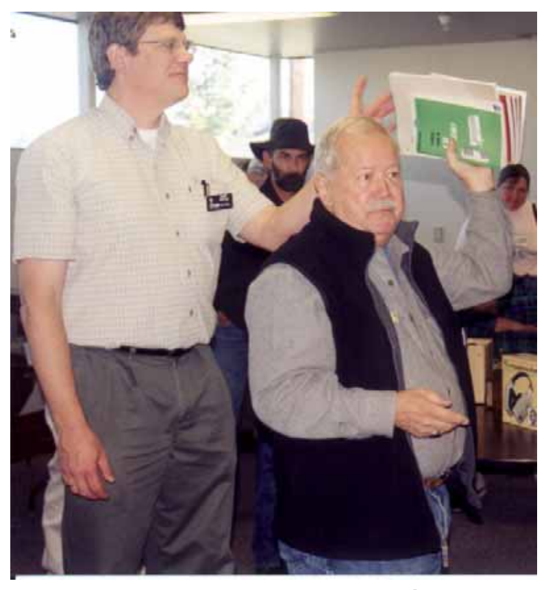
Going once, Going twice, Sold!