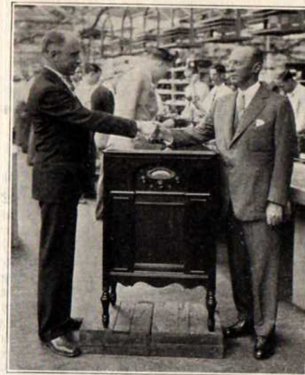
A. Atwater Kent congratulates his production manager on the 3,000,000th Receiver, produced at the Atwater Kent factory.

The same authority reported that its survey revealed that nearly sixty per cent of radio set owners had possessed their sets less than two years. That the old crystal set, representing the first stages of radio, has practically disappeared is shown by the report from the same source that only approximately three per cent of Radio owners now have crystal sets.