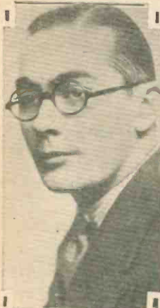
CARROLL GIBBONS who conducted the orchestra during the first broadcast in the series. He is an American who went to London with RUDY VALLEE's Orchestra but did not return with it.