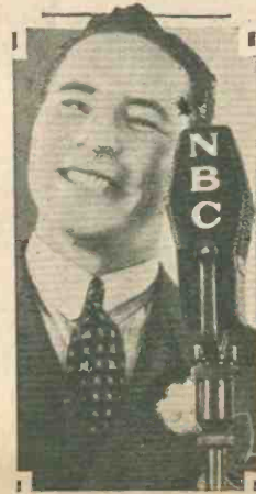
MAX BAER, recently knighted heavyweigh champion of the ring, who discusses, in the accompanying exclusive interview, his plans for himself and his brother.

on October 7 we start shooting the actual film. If my sponsors wish me to talk a great deal I'll have to rehearse radio between picture scenes, and will I be busy. Oh, Boy!"