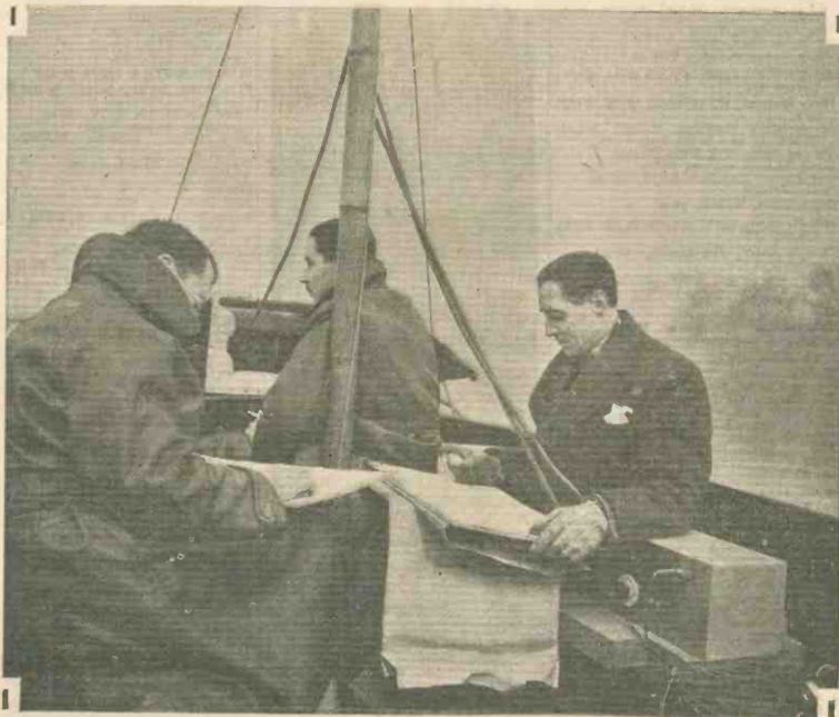
ANNOUNCERS and control man are here photographed just before the broadcast of an English boat race. These races are among the most frequent of the spot news broadcasts in Great Britain.

tors in Britain were thinking of following the American lead, some of the great stores and other leading advertisers also contemplated operating their own wireless services as adjuncts to their publicity.