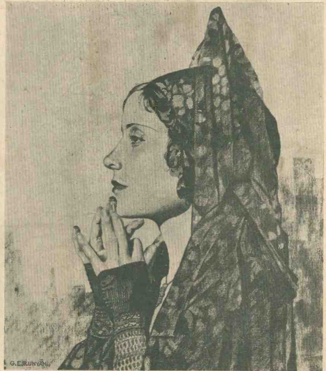
Countess Olga Albani, Soprano