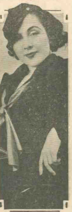
LEE WILEY, actress and singer, who presents dramatic sketches during WHITEMAN'S programs on Thursdays.