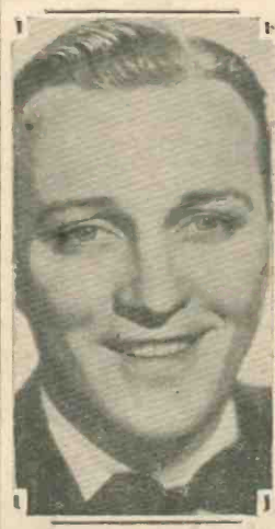
BING CROSBY, CBS vocalist, returns to radio next fall after an absence while making pictures in Hollywood.