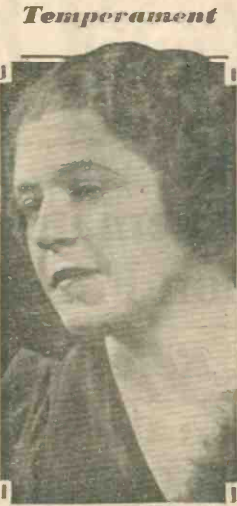
LOTTE LEHMANN, notable soprano who takes part in the performance of "Fidelio" to be broadcast from Salzburg over the NBC-WEAF network this Saturday, beginning at 2.15 P. M.