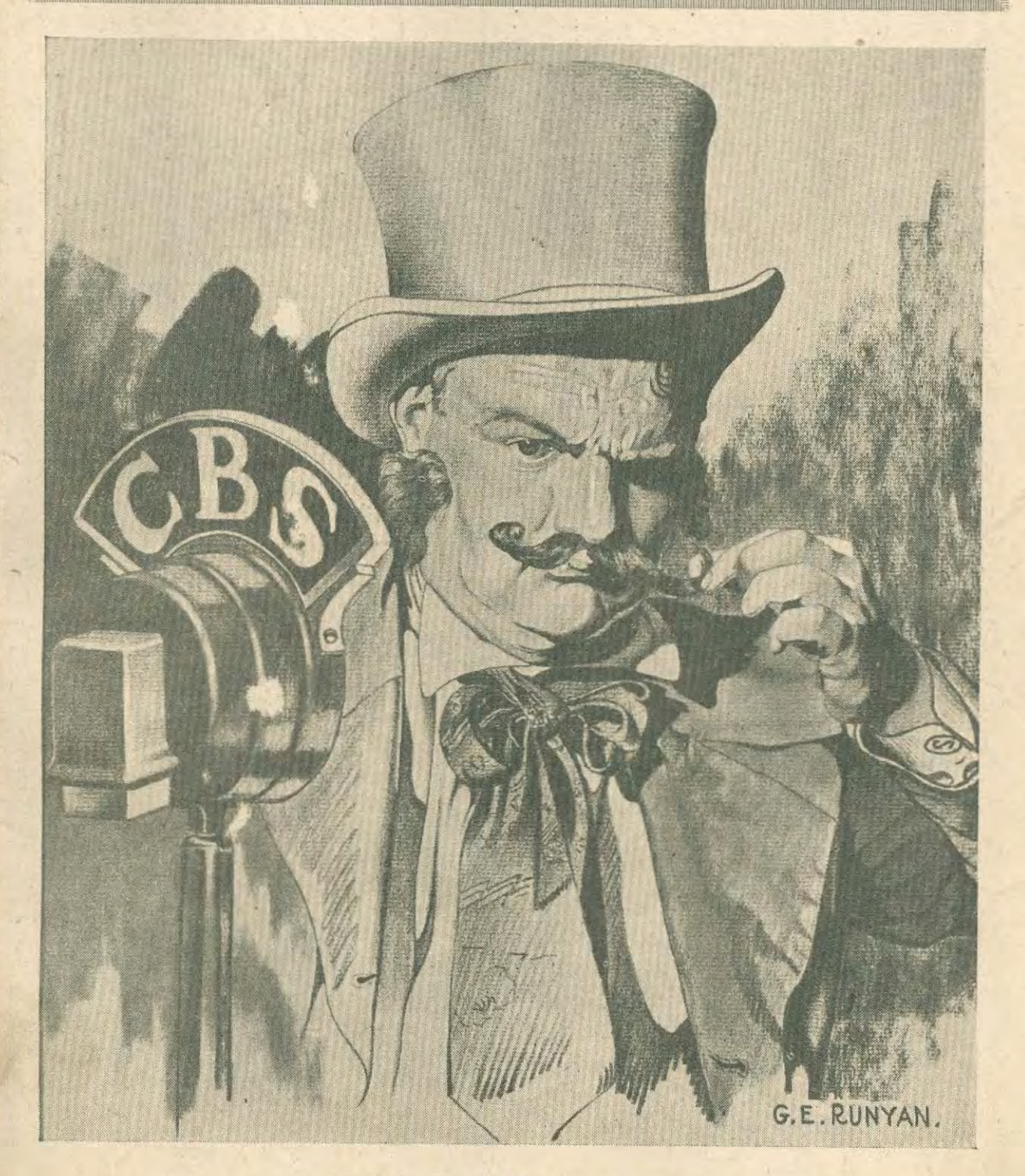
Col. Lemuel Q. Stoopnagle