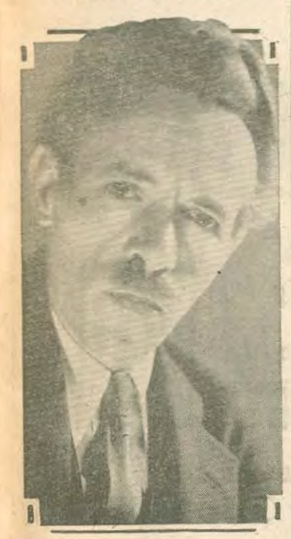
won him medals.