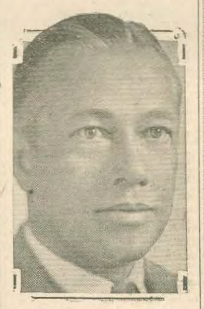
baritone, who appeared last week as a guest with the Champions.