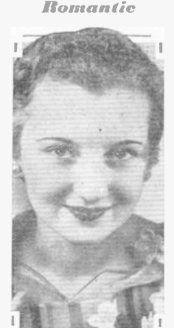
ALICE FROST, actress and impersonator, who plays the heroine in the "Taxi" dramas starring MAX BAER, broadcast Mondays, Wednesdays and Fridays at 7:45 P.M. over an NBC-WJZ network.