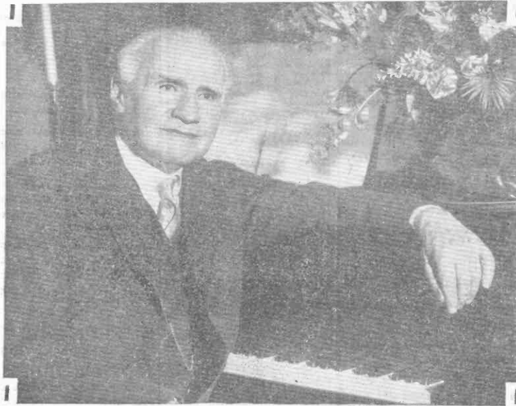
DR. WALTER DAMROSCH, veteran conductor, whose pioneer work on the radio has won him affection and admiration.