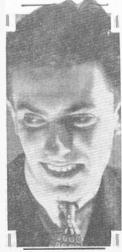
Eddie Duchin, NBC maestro, who gives several disc programs a week on the air with the aid of his skilled orchestra.