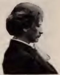
PADEREWSKI

During the orchestral introduction Tonio , in clown costume, appears and explains that the subject of the play is taken from real life; reminds the audience that actors are but men, with passions like their own, and that the author has endeavored to express the real feelings and sentiments of the characters he will introduce. He then orders up the curtain. The first act shows the entrance to an Italian village. Canio , and his troupe of strolling players, or pagliacci , having paraded through the village, now announce a performance for that evening at seven, and Canio goes with Pepe into the tavern. Tonio , the clown,