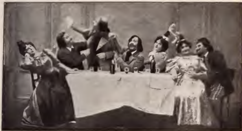
SCENE FROM LEONCAVALLO'S BOHÈME (THÉÂTRE LYRIQUE, 1899)