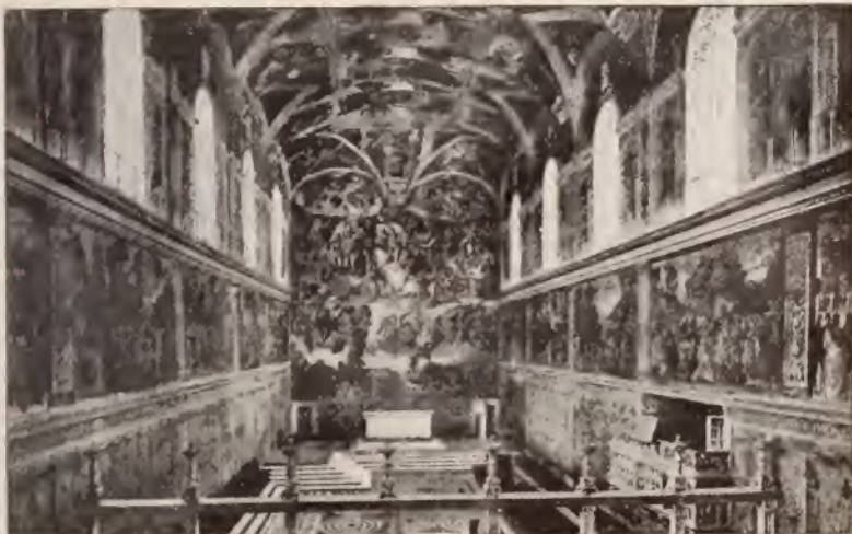
INTERIOR OF SISTINE CHAPEL, ROME