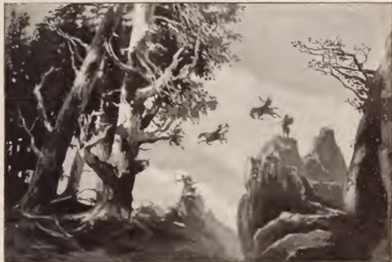
VICTOR BOOK OF THE OPERA