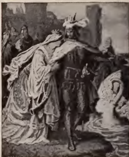
ELSA AND LOHENGRIN

Most of us are familiar with the story of the Knight Lohengrin , who comes in his boat, drawn by a swan, to defend Elsa from the charge (preferred by Telramund and Ortrud , who covet Elsa's estates) of having murdered her young brother, Godfrey . Telramund is vanquished and disgraced by Lohengrin , who wins Elsa as his bride. One condition he exacts from her—that she shall never ask who he is or whence he came. By the influence of Ortrud , however, she rashly questions him, and in fulfillment of his vow, but in deep grief, he is compelled to leave her and departs in his boat drawn by a dove. The ethereal Grail harmonies, the lovely Swan Motive , the noble Prayer of the King and the Bridal Chorus , make this one of the most melodious of all the master's operas.