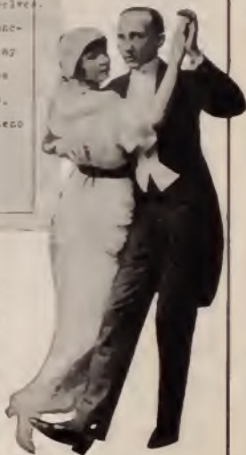
Dancing the Tango