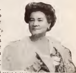
SCHUMANN-HEINK

Mme. Schumann-Heink, desiring that her records should be as nearly perfect as possible, and worthy of her great reputation, has signed an exclusive agreement with the Victor Company.