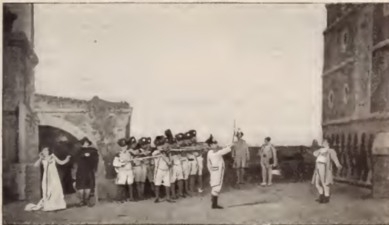
VICTOR BOOK OF THE OPERA