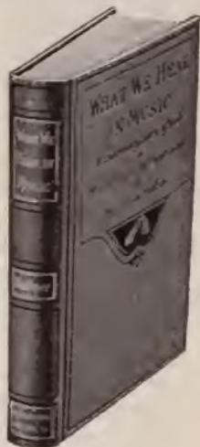
400 pages, 6½ x 9½ fully illustrated