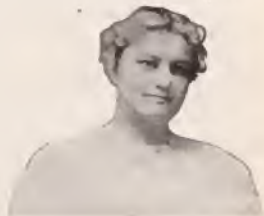
IRWIN

It is with pleasure, therefore, that we are able to announce several songs by this favorite entertainer. They are delivered in the delightfully humorous manner which has made Miss Irwin famous as a fun-maker.