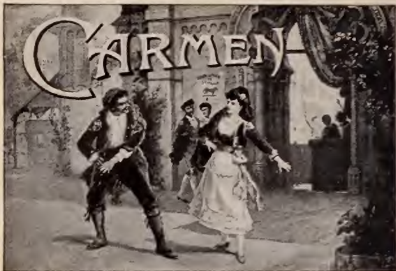
CARMEN'S DEFIANCE—ACT IV