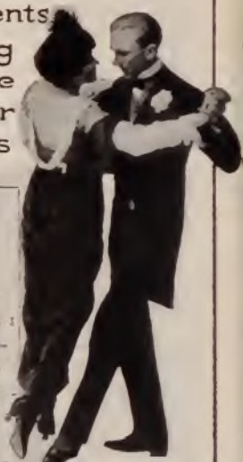
Dancing the Hesitation

CASTLE HOUSE 20 EAST 42ND STREET NEW YORK