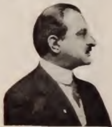
COPIED BY HIS OWN