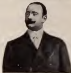
EMILIO DE GOGORZA

Mr. de Gogorza's list of Victor records is a very large one and shows his great versatility, no less than forty selections in Spanish, French, Italian and English having been contributed by him to the Victor catalogue. This artist sings exclusively for the Victor.