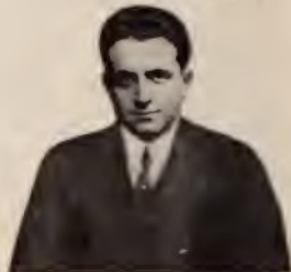
AMATO

Pasquale Amato, one of the most popular baritones ever heard in opera in America, was born thirty-three years ago in Naples and belongs to one of the best families of that city. Destined by his parents for a civil engineer, he had studied singing merely as an amateur, but his friends were so enthusiastic over his splendid vocal qualities that he was strongly urged to enter the Naples Conservatory. After three years there, he made his debut at the Bellini Theatre in 1900, as Germont . He early gained a reputation which reached the South American impresarios and was soon engaged for Buenos Aires, where he met Toscanini. It was at the latter's suggestion that he went to Milan and sang for Mr. Gatti-Casazza, who was then the director-general of the Scala Opera. Mr. Gatti-Casazza immediately engaged him, and he became a prime favorite.