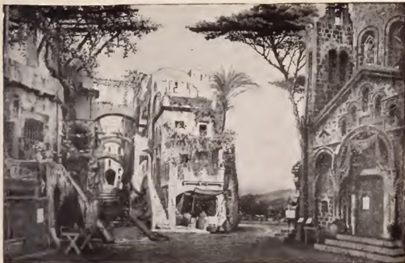
THE METROPOLITAN OPERA HOUSE SETTING