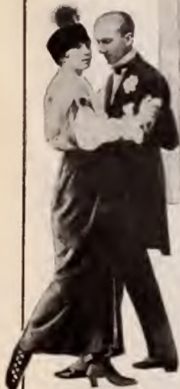
Dancing the One Step

The Victor's list of dance records, which Mr. and Mrs. Castle have so fully approved, now contains more than 350 selections, placing at your disposal the most complete and comprehensive list in the world.