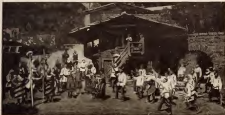
VICTOR BOOK OF THE OPERA