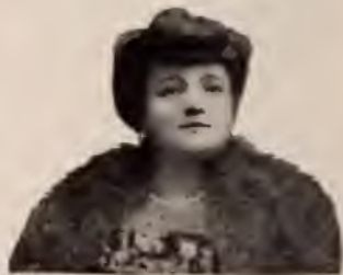
CALVÉ

Emma Calvé was born in 1864, at Madrid. She studied under Marchesi and Puget, and made her début at Nice. Her first important appearance was at Brussels in 1882 as Marguerite . This artist's triumphs in America are familiar to all, and although she is now in Europe her admirers find consolation in her Victor records.