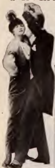
Dancing the Maxixe

The greatest exponents of Modern Dancing who now supervise the making of Victor Dance Records