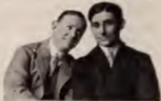
COPY RIGHTS DAVE AND FRED