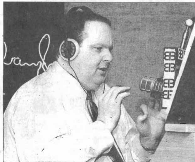
SET IN HIS WAYS: Limbaugh's is truly a one-man show.

Unlike most radio talkers, he cruises along without guests, and, in fact, very few