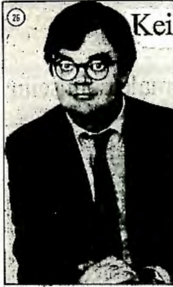
GARRISON KELLOR: funny and profound