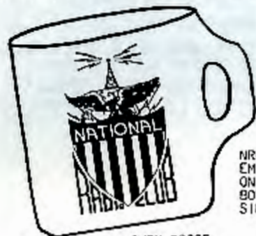
NRC EMBLEM ON BOTH SIDES